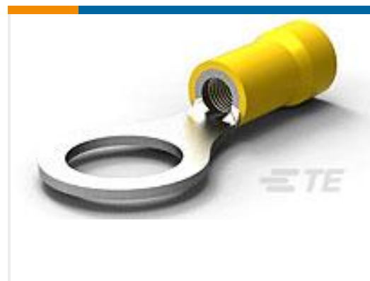
TE Part #160300 PLASTI-GRIP 12-10 RING M10