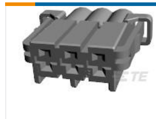
TE Part #2-968976-9 MCP2.8 BU-GEH 3P