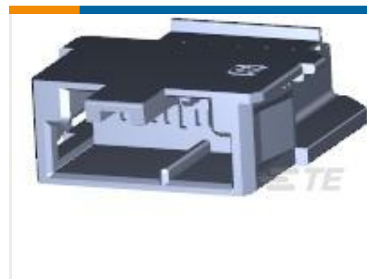
TE Part #2-968977-9 2,8MM FLA-STE-GEH3P