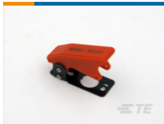
TE Part # K1127139 Switch guard 07-0-0-30