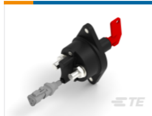
TE Part #K1138460 Battery Disconnecter, 500A, 1 Pole