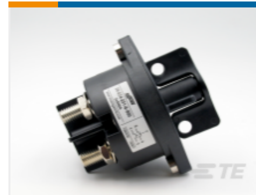
TE Part #K1156392 Battery Disconnecter 35-524-231-R-A- 906