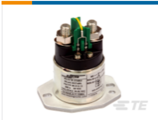
TE Part #K1151414 Power Relay, 300A, Standard, Bistable, 2 Coils, Polarized