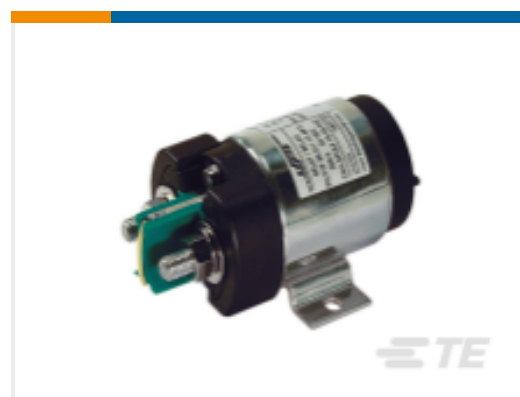
TE Part # CAT-AL6-KSPR30200 Power Relay, 200A, Standard, Bistable, 2 Coils, Polarized