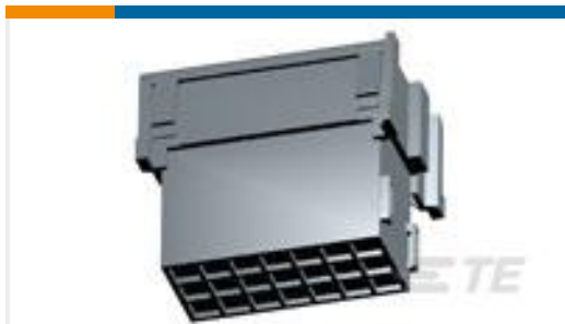
TE Part #4-967630-1 FLACHSTE-GEH2,8 21P