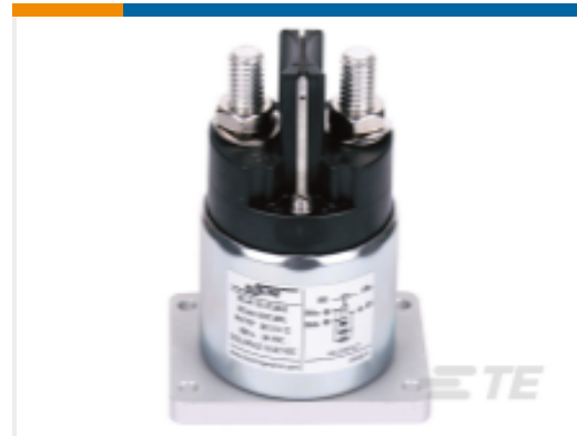
TE Part #K1133909 Bi-Relay 30-513-12