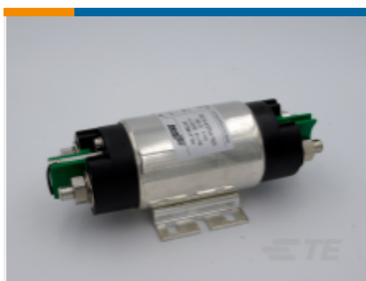
TE Part # CAT-AL6-KSPR29200 Power Relay, 200A, Standard, Monostable, DC