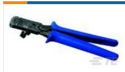
TE Part #6-1393462-5 GET-B HAND CRIMPING PLIERS