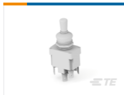
TE Part #K1123283 Toggle Switch 08-2-2-24 P 933