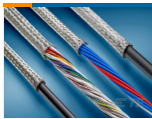
TE Part #CQ50513001 RAY-103-10.0(10)