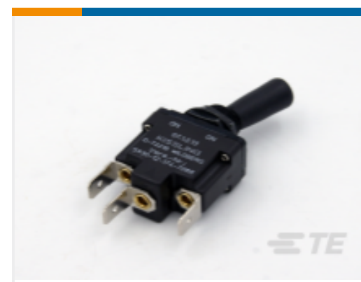
TE Part #K1002975 Toggle Switch 07-1-2-13