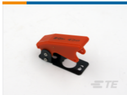
TE Part # K1127139 Switch guard 07-0-0-30