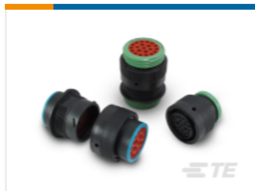
TE Part #HDP26-24-35PN DEUTSCH HDP20 Housings