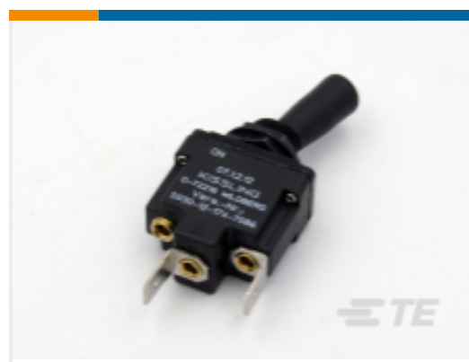
TE Part #K1002974 Toggle Switch 07-1-2-12