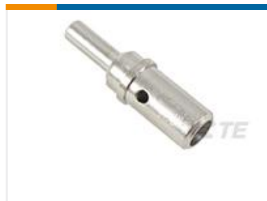
TE Part #0460-204-08141 PIN, SOLID, SIZE 8, 8-10AWG, NI