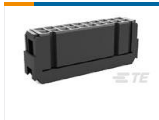
TE Part #1658620-9 40 NOVO MIL 15DP, LEAD FREE