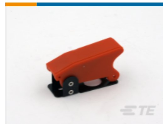
TE Part #K1022530 Switch guard 07-0-0-01