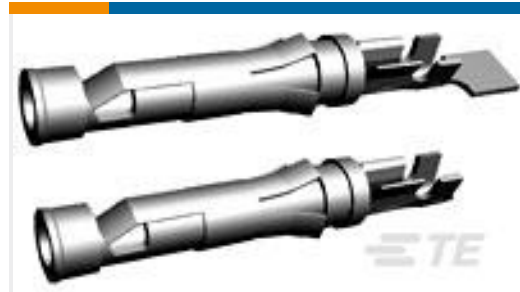
TE Part #1-66598-1 III+ SKT, 18-14, 30AU/FL, STRIP