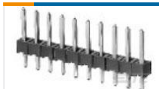
TE Part #9-146274-0 40 MODII HDR SRST B/A .100CL