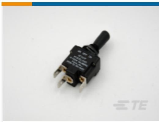
TE Part # K1002979 Toggle Switch 07-1-2-17