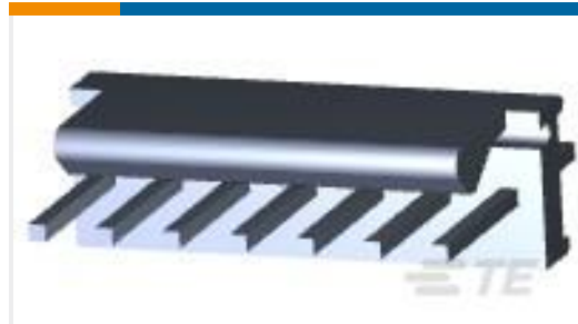
TE Part #3-641126-7 07P MTA100 HDR ASY FL/STR LF