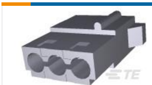
TE Part #1-480303-0 03P CMNL PLUG HSG F/H NATL