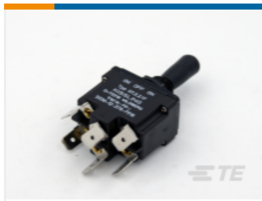
TE Part # K1002983 Toggle Switch 07-2-2-17