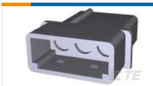
TE Part #1-480305-0 03P CMNL CAP HSG F/H NATL