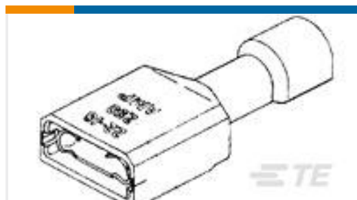
TE Part #3-520124-2 187 ULTRA-FAST ASY REC 16-14 AWG TPBR