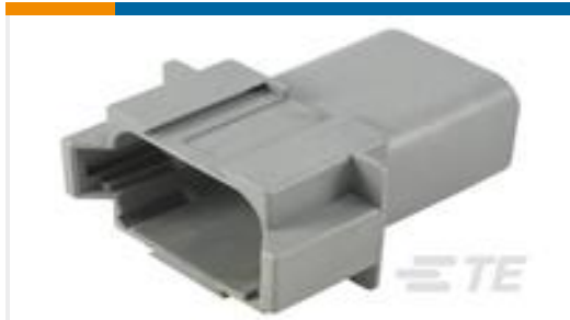
TE Part #DT04-08PA REC, 8P, GRY, N, A