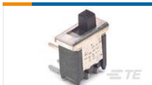
TE Part #1571982-1 TSS11DGPC04=SLIDE SWITCH SPDT