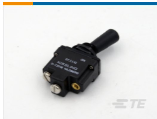
TE Part # K2015512 Toggle Switch 07-1-1-10