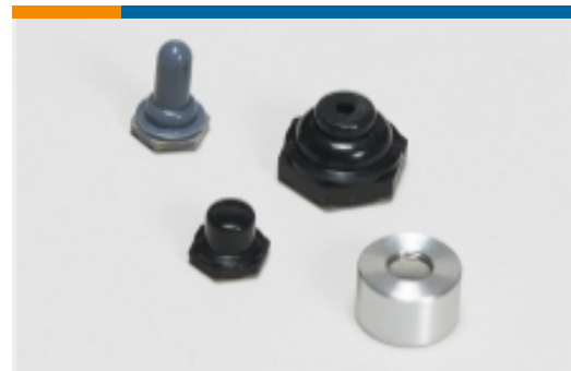
Switch Seals & Accessories(7)