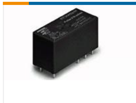
TE Part #3-1419108-1 RTD14024F