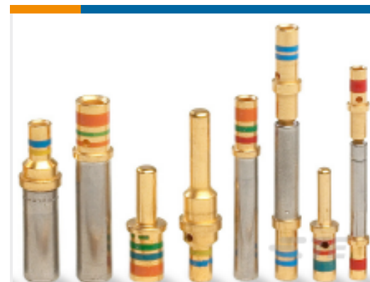
TE Part #12333-20 CONT SOC ASSY