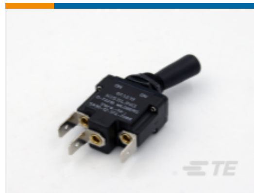
TE Part # K1002975 Toggle Switch 07-1-2-13