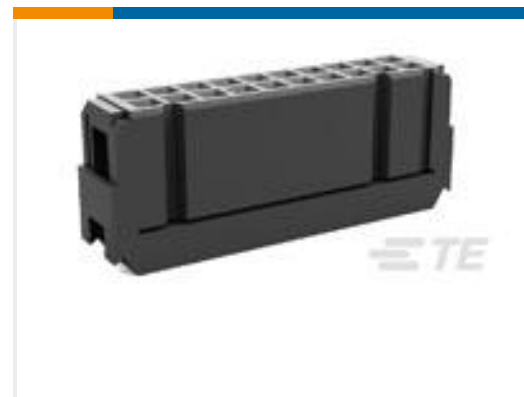
TE Part #1658620-9 40 NOVO MIL 15DP, LEAD FREE