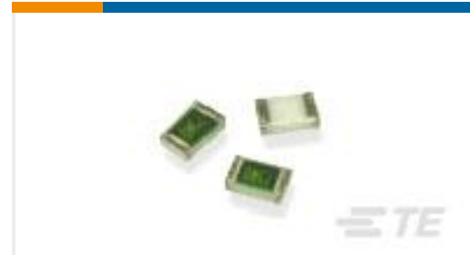
TE Part #1614349-9 RN 0603 10K 0.1% 10PPM CUT LENGTH