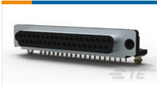
TE Part #5747847-4 37 MSFL RCPT RA 318 (IN,FM,BL)