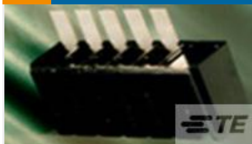
TE Part #146845-1 BATT INT,KEYLESS,5P,7.2V