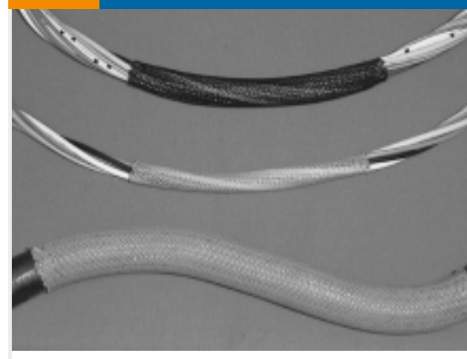
TE Part #CH02054001 VERSAFLEX-3/4-0-SP