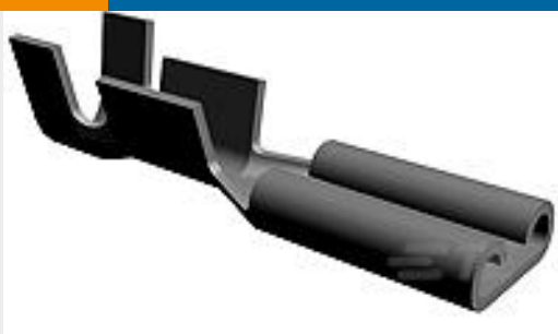
TE Part #61813-1 093 FASTON REC 26-22 AWG TPBR