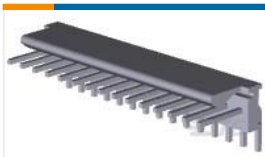
TE Part #1-640457-5 15P MTA100 HDR ASSY SQ R/A F/L