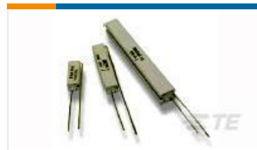
TE Part #1623729-6 BCHE 17 W 15R 5%