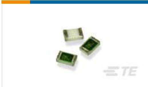
TE Part #1879215-7 CPF 0402 4K64 0.1% 25PPM 1K RL