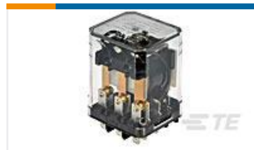
TE Part #6-1393116-2 KUMP-11A18-120=KU