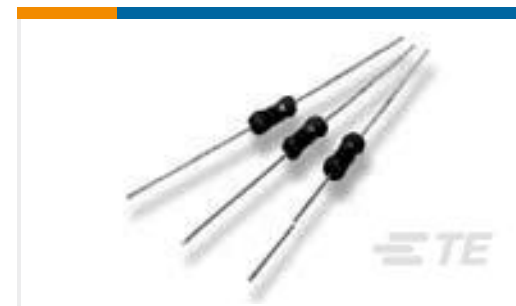
TE Part #4-1625892-1 3W SM M/OX 5% 330R