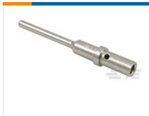
TE Part #0460-202-20141 PIN, SOLID, SIZE 20, 20AWG, NI