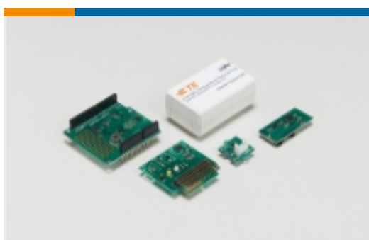
Sensor Development Boards and Evaluation Kits(2)