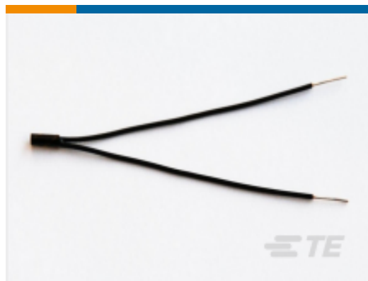
TE Part #GA10K3MBD1 MBD9-PROBE