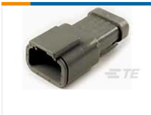
TE Part #DTM04-3P-E003 REC, 3P, GRY, N, CAP