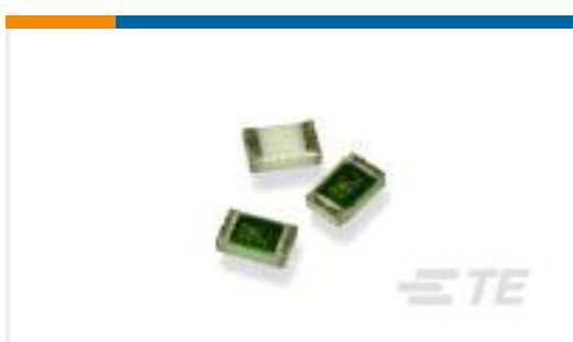
TE Part #3-1879215-1 CPF 0402 8K45 0.1% 25PPM 1K RL