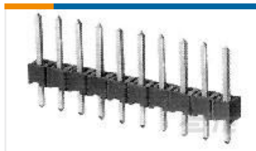
TE Part #826629-1 AMP MODU II PIN HDR.1X01P