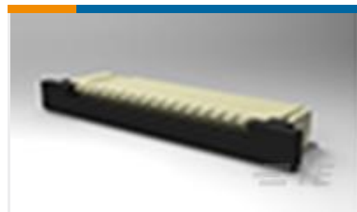
TE Part #84953-8 1MM FPC HORZ.TOP CONT.ASSY 8P