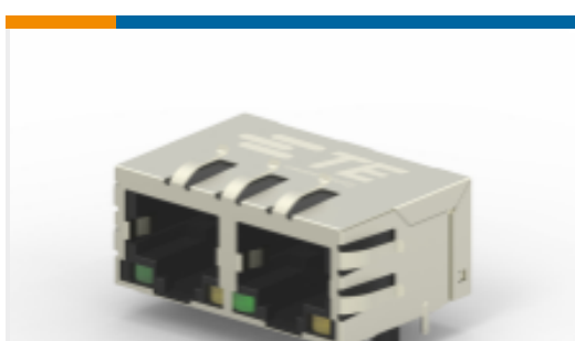
TE Part #5-2301996-8 RJ45 JACK INT.MAG. 1GB LED 1X2