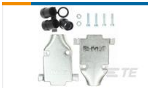
TE Part #5748676-2 DIE CAST CBL CLMP KIT,SZ 2