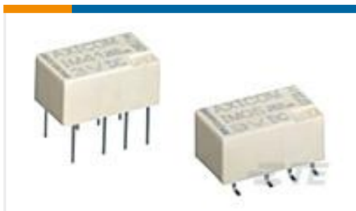
TE Part #1462037-4 IM01TS=IM RELAY 140mW 3V