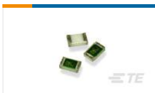
TE Part #8-1614884-8 CPF 0805 16K 0.1% 25PPM 1K RL