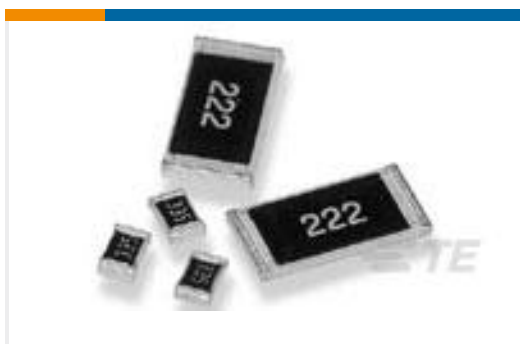
TE Part #5-1879501-9 CRGH2512 5% 270R 2W