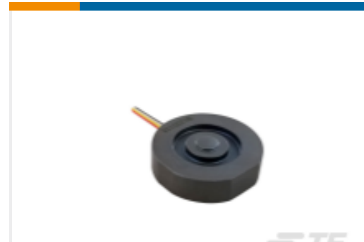
TE Part #20009605-20 FX29K0-100A-0010-L