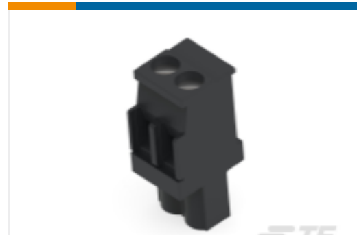
TE Part #2213934-2 SMT TB PERP PLUG, 5.0MM, 2 POS