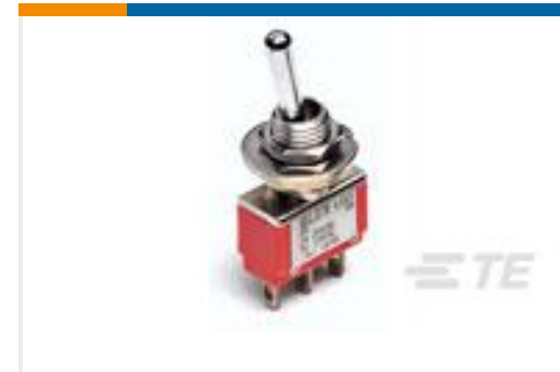
TE Part #5-1825137-0 A107SYCB04