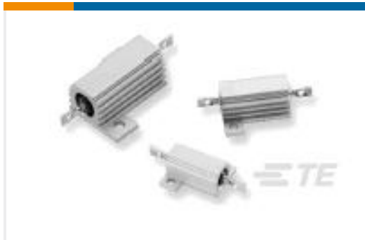
TE Part #3-1879073-5 THS10 150R 5%