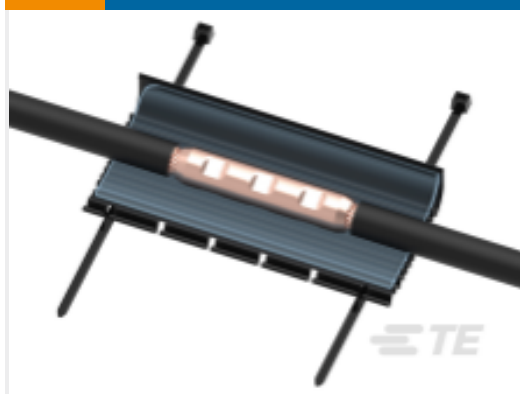
TE Part # 093852-000 GELWRAP-18/4-100(B6)