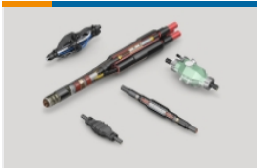
Joints & Splices(24)