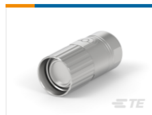
TE Part #ASA000N00730235000 623 PLUG