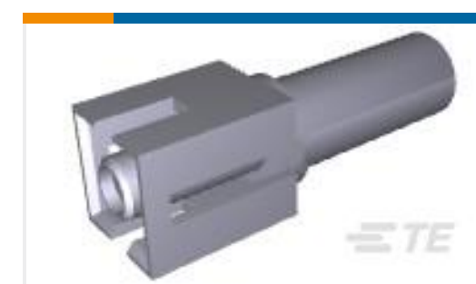
TE Part #926472-3 1P UNIV MNL BU GEH