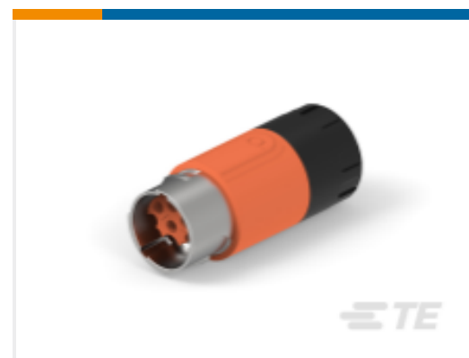
TE Part # EKB201N00330500000 915 EXTENSION