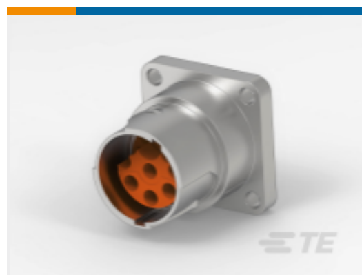
TE Part # EEA201N00000500000 915 ITEC RECEPTACLE