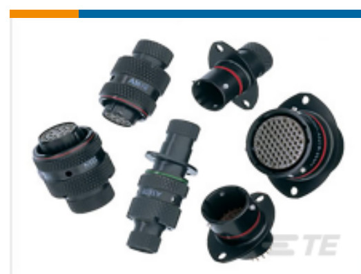
TE Part #ASL606-05PD-HE PLUG ASSY. AS MICRO MK3.