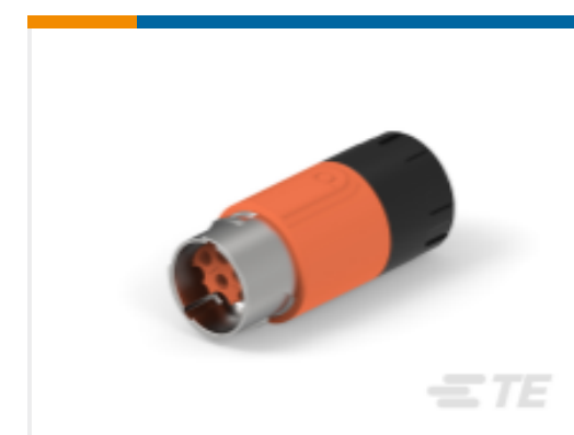
TE Part #EKB201N00330500000 915 EXTENSION