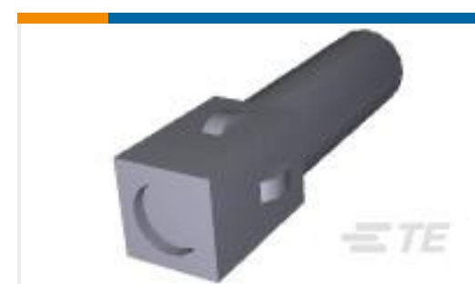
TE Part #926471-3 1P UNIV MNL ST GEH