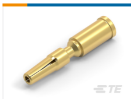
TE Part #60-0251-011-000 CONTACT SOCKET 1 MM