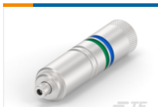
TE Part # C0-0258-000-000 POSITIONING INSERT FOR 1 MM CONTACTS