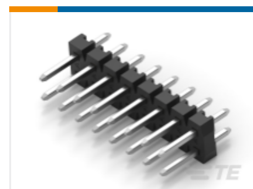
TE Part #2842138-8 16P,2MM,BRK HDR,DRVT,2.8,0.1AU, BOX