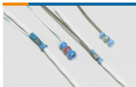
SolderSleeve Shield Terminators(3)