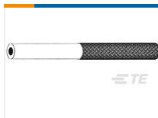
TE Part #C750743001 RAY-103-3.0(100)