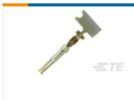
TE Part #1658537-4 SOCKET CONT DUPL PLT LP HD-20