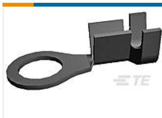
TE Part #160102-2 RING TONGUE WITH IS 20-16 0.0253 TPBR