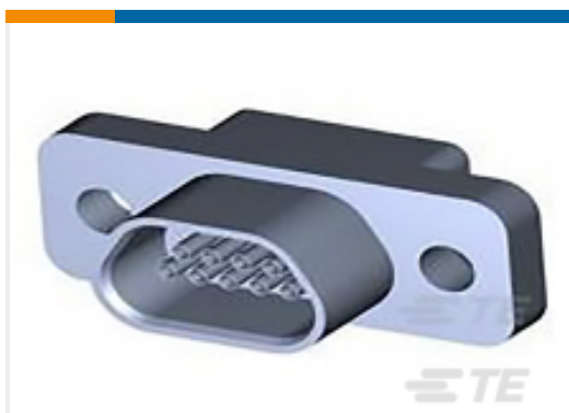
TE Part #1532211-1 M83513/01-CN, MCKS-N1-B-21PS