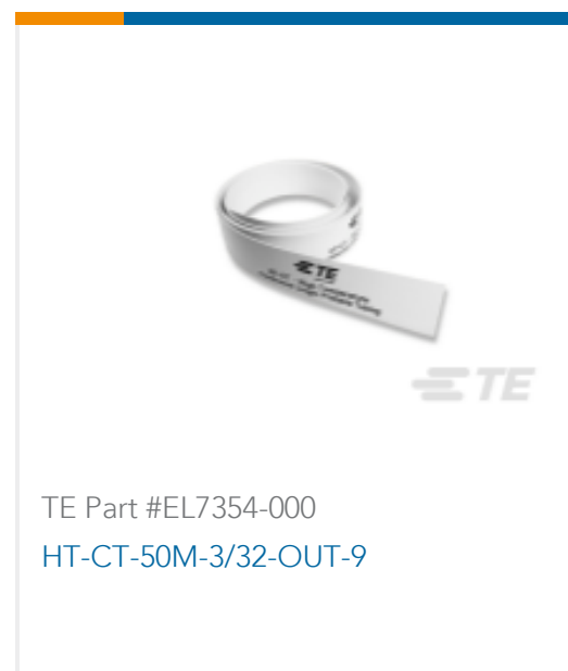
TE Part #EL7354-000 HT-CT-50M-3/32-OUT-9