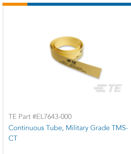
TE Part #EL7643-000 Continuous Tube, Military Grade TMS-CT