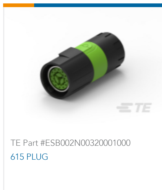
TE Part #ESB002N00320001000 615 PLUG