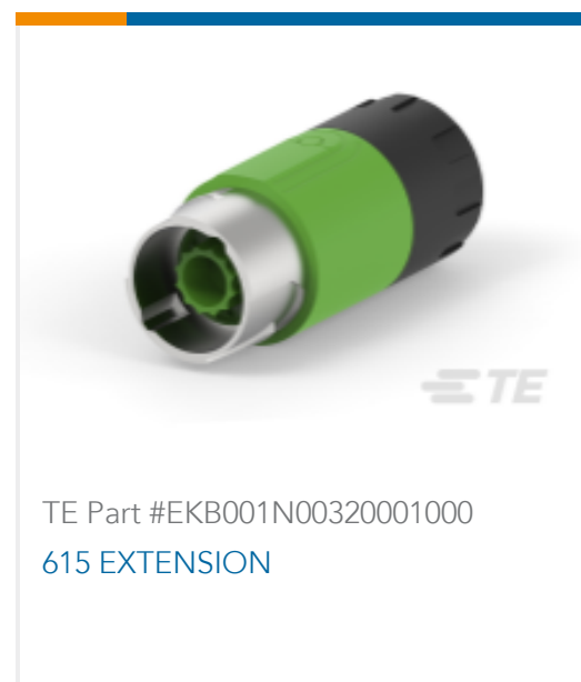
TE Part #EKB001N00320001000 615 EXTENSION