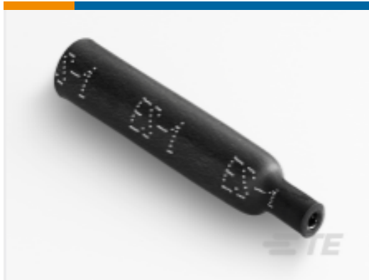
TE Part # 3371890003 ES-CAP-NO.1-C1-0-35MM