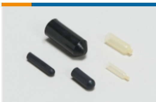
Heat Shrink Caps(40)