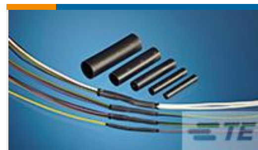
TE Part #CH02966001 QSZH-125-NR2-50MM