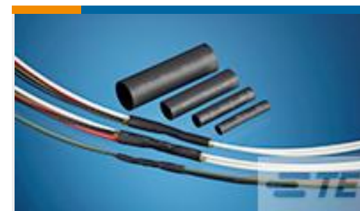
TE Part #2525596002 RBK-ILS-125-NR1-0-50MM