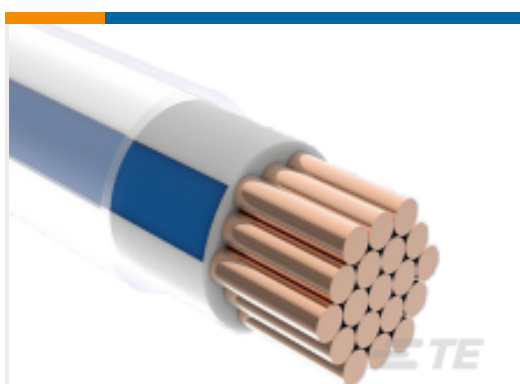
TE Part #2394563001 ACW0219-0.35-2(NS)