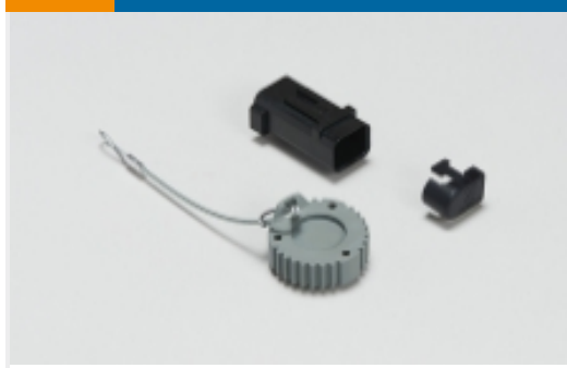
Automotive Connector Caps & Covers (19)