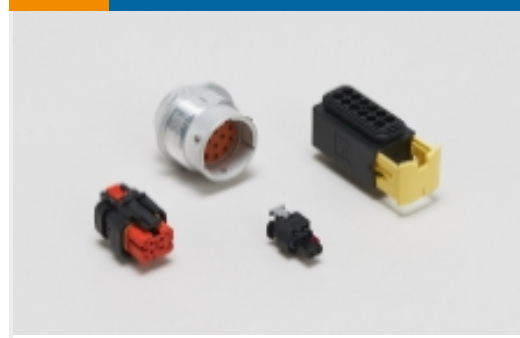
Automotive Housings (620)