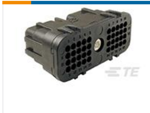
TE Part #DRC26-40SA-L011 PLG, 40P, BLK, N, ROUTER CAP, A