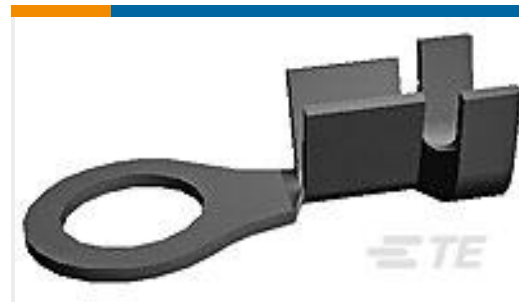
TE Part #41346 RING TERMINAL 18-14 AWG NPSTL