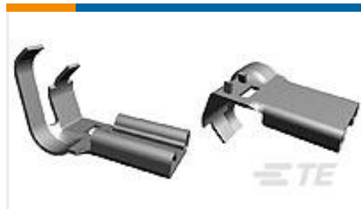
TE Part #41531-1 250 FASTON FLAG REC 18-12 AWG NPST