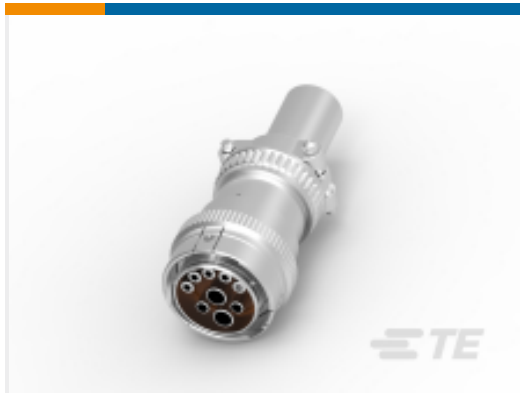
TE Part #HDB36-24-91SE-059 BR AWY PL ASM, MC