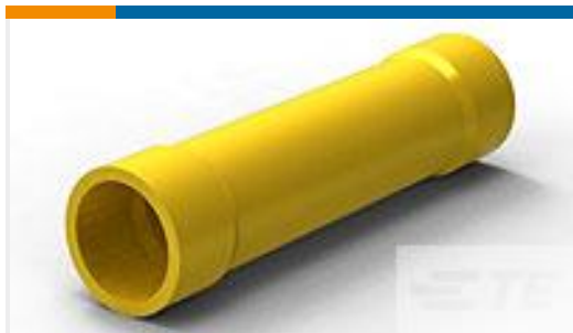
TE Part #2-34072-2 SPLICE, PG BUTT 12-10