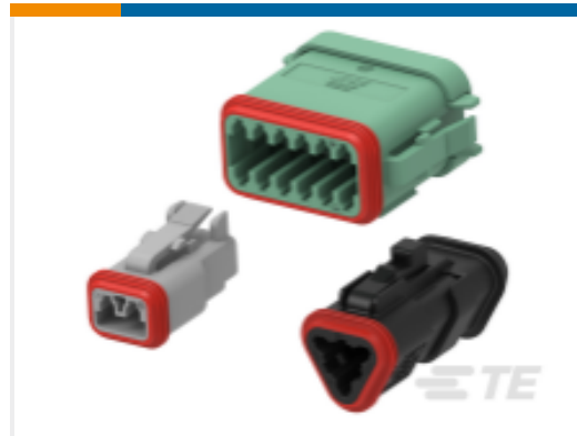
TE Part #DT06-08SB-CE05 DEUTSCH DT Plug Connectors