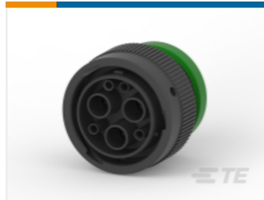
TE Part #HDP26-24-7SN-CL18 PLG, 7P, BLK, N, 4AWG, RNG, 4/16, S