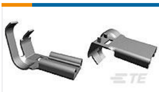
TE Part #60641-1 250 FASTON FLAG REC 18-12 AWG BR