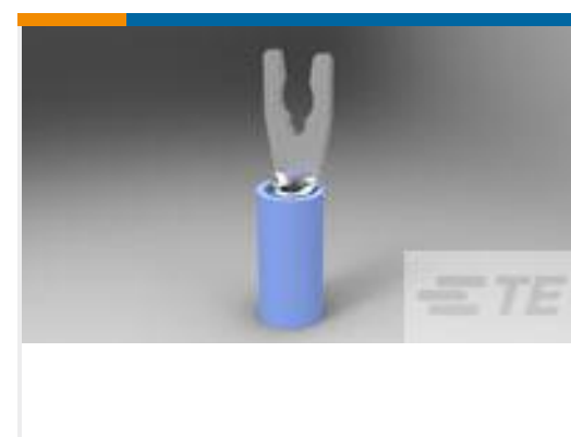
TE Part #52934-1 TERMINAL,PIDG SPR SPD 16-14 5