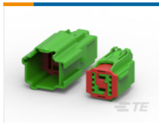
TE Part #1456987-3 GET .64 CONNECTOR SYSTEM, CONNECTOR HSG