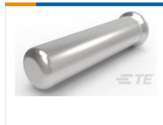
TE Part #5050462-8 SOCKET,MIN-SPR SN-AU SER-2