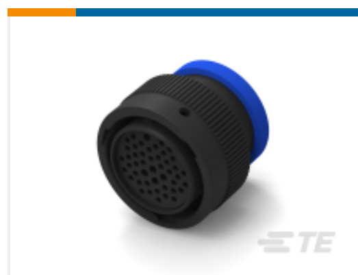
TE Part #HDP26-24-47SE-L017 PLG, 47P, BLK, E, RNG, 16/20, S