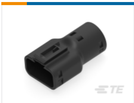
TE Part #1028-034-1205 BKSHL, 12P, BLK, REC, ST, NW 13/17