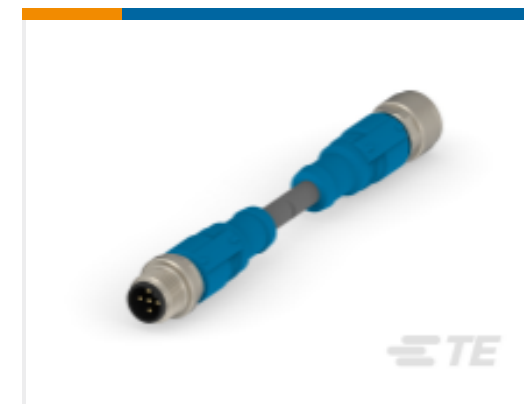
TE Part #T4162123005-001 RPC-M12-5MS-0.5SH-M12-5FS-PUR