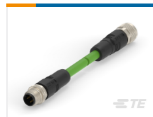
TE Part #TAD14545101-020 M12D4-MS-FS-PUR-22SH-TYPE C GREEN-2.0M