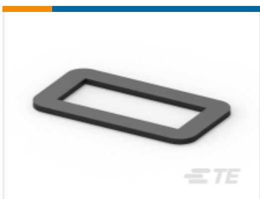
TE Part #DRC40-GKT GASKET, 40P, BLK, DRC16