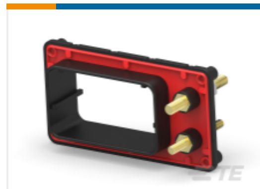
TE Part #YDRBM-3A0000000000 FLANGE, MOUNT, 102/128P, BLK, STUD, A