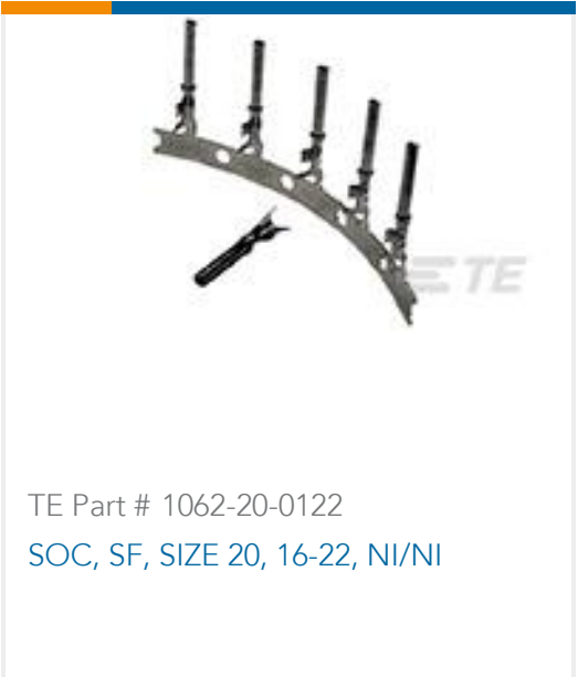
TE Part # 1062-20-0122 SOC, SF, SIZE 20, 16-22, NI/NI