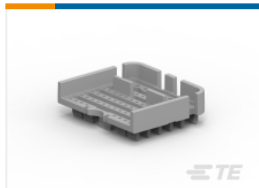
TE Part #WB-64PA WEDGE LOCK, 128P, REC, GRY, DRB, A