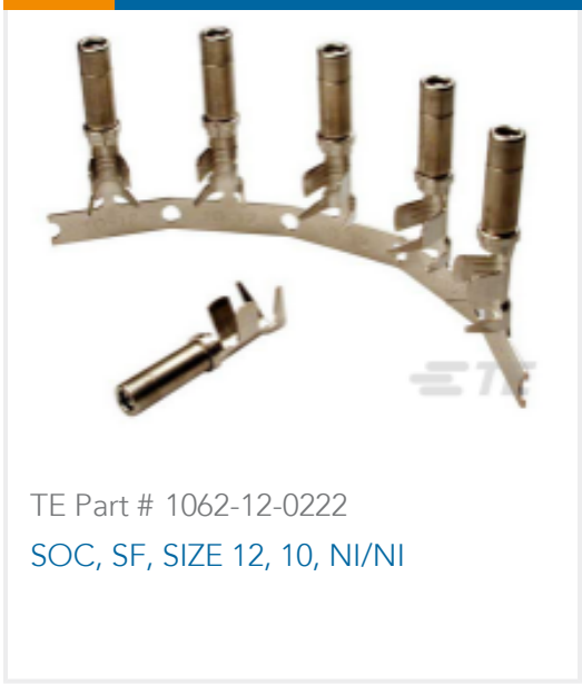
TE Part # 1062-12-0222 SOC, SF, SIZE 12, 10, NI/NI