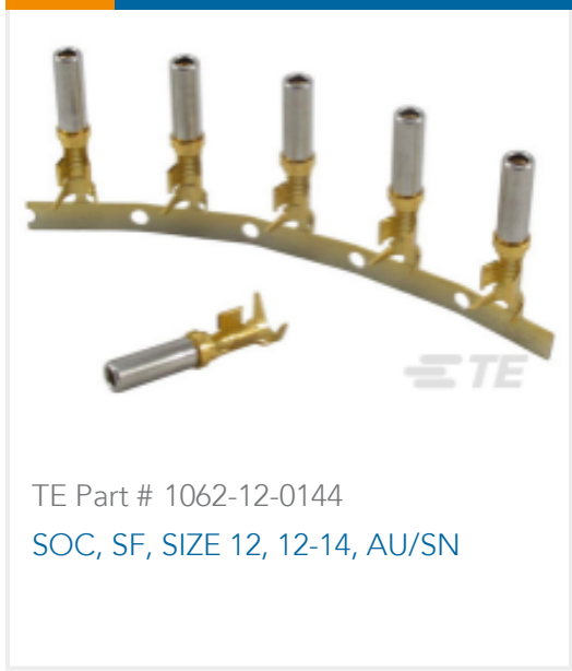
TE Part # 1062-12-0144 SOC, SF, SIZE 12, 12-14, AU/SN