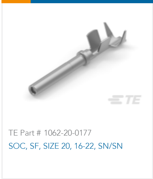
TE Part # 1062-20-0177 SOC, SF, SIZE 20, 16-22, SN/SN