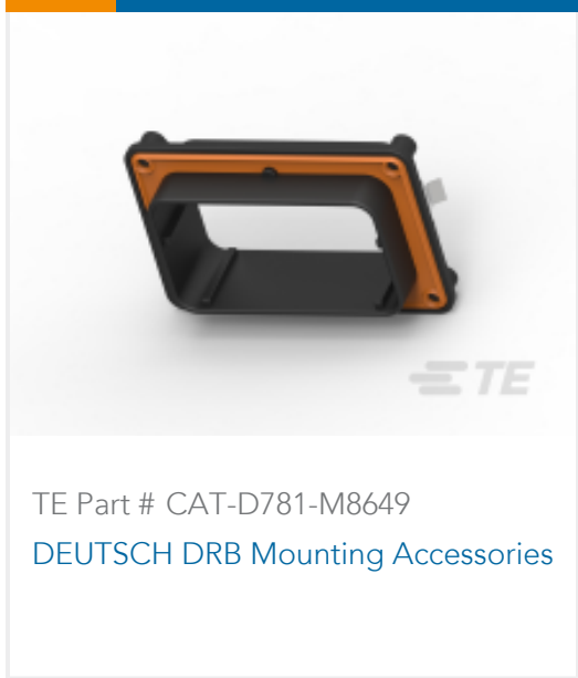
TE Part # CAT-D781-M8649 DEUTSCH DRB Mounting Accessories