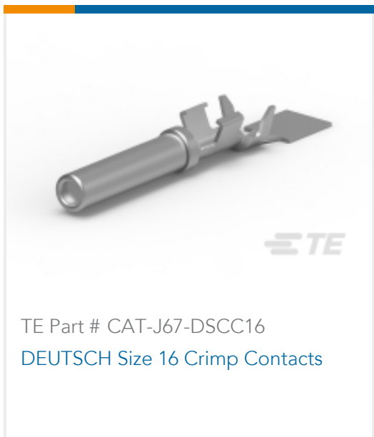
TE Part # CAT-J67-DSCC16 DEUTSCH Size 16 Crimp Contacts