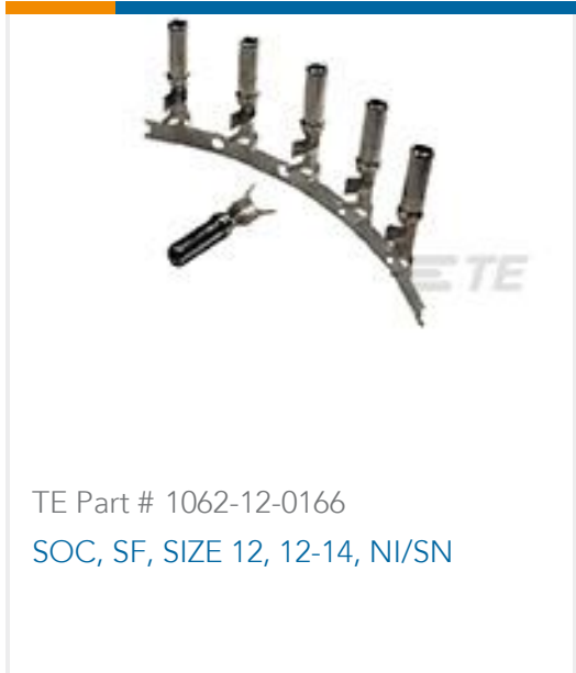
TE Part # 1062-12-0166 SOC, SF, SIZE 12, 12-14, NI/SN