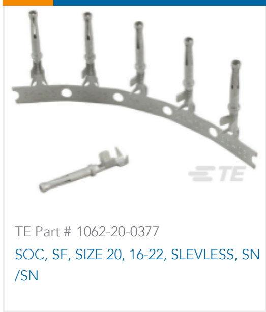
TE Part # 1062-20-0377 SOC, SF, SIZE 20, 16-22, SLEVLSS, SN/SN