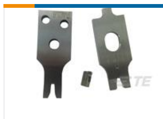
TE Part #7-2151259-7 OCEAN_2.0_SPARE_PART_KIT-110F2600