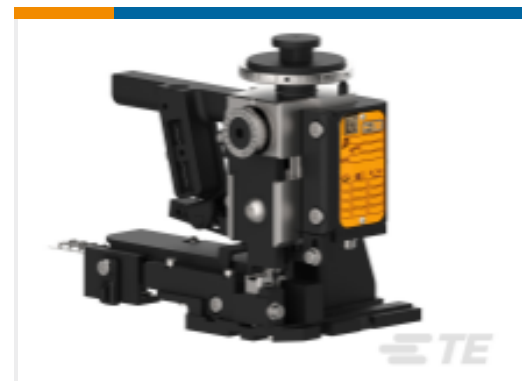
TE Part #2836995-1 OCEAN_2.0_APPLICATOR-S-070F1550