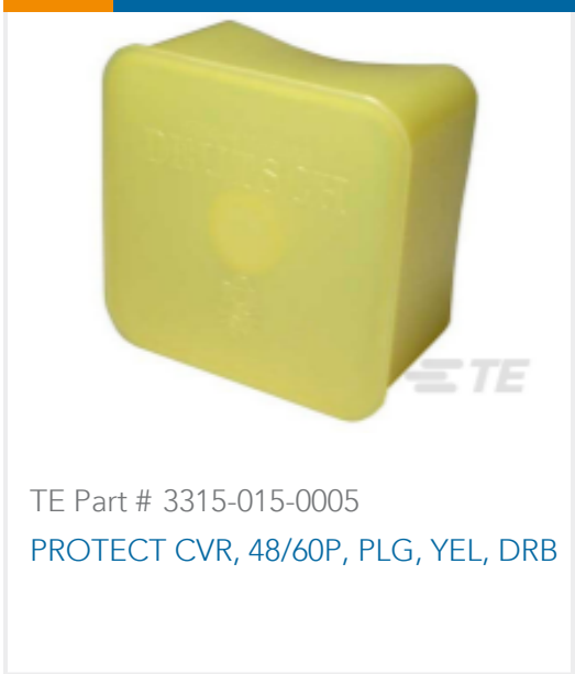
TE Part # 3315-015-0005 PROTECT CVR, 48/60P, PLG, YEL, DRB