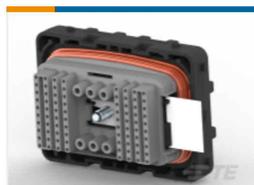
TE Part #DRCP28-86SC PLG, 86P, BLK, 12/20, C