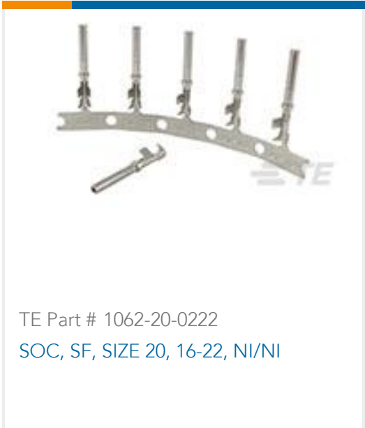
TE Part # 1062-20-0222 SOC, SF, SIZE 20, 16-22, NI/NI