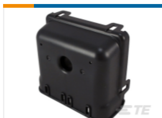
TE Part #4828-007-8605 BKSHL, 86P, BLK, VERTICAL, DRCP