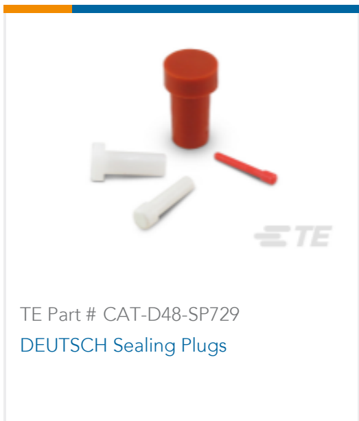
TE Part # CAT-D48-SP729 DEUTSCH Sealing Plugs