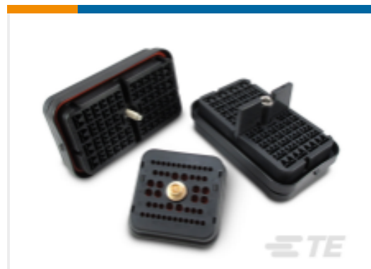
TE Part #DRB16-128SAE-L018 DEUTSCH DRB Housings