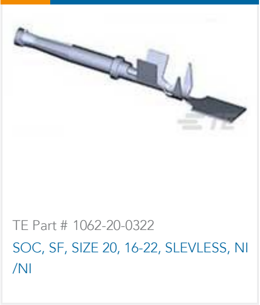
TE Part # 1062-20-0322 SOC, SF, SIZE 20, 16-22, SLEVLSS, NI/NI