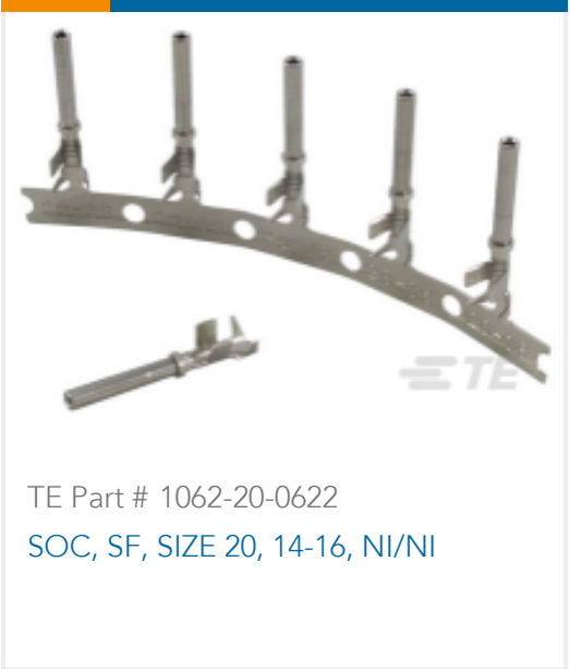
TE Part # 1062-20-0622 SOC, SF, SIZE 20, 14-16, NI/NI