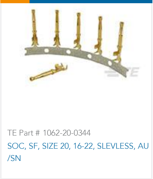
TE Part # 1062-20-0344 SOC, SF, SIZE 20, 16-22, SLEVLSS, AU/SN