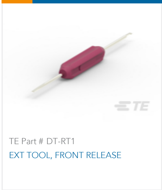
TE Part # DT-RT1 EXT TOOL, FRONT RELEASE