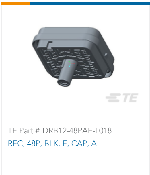
TE Part # DRB12-48PAE-L018 REC, 48P, BLK, E, CAP, A