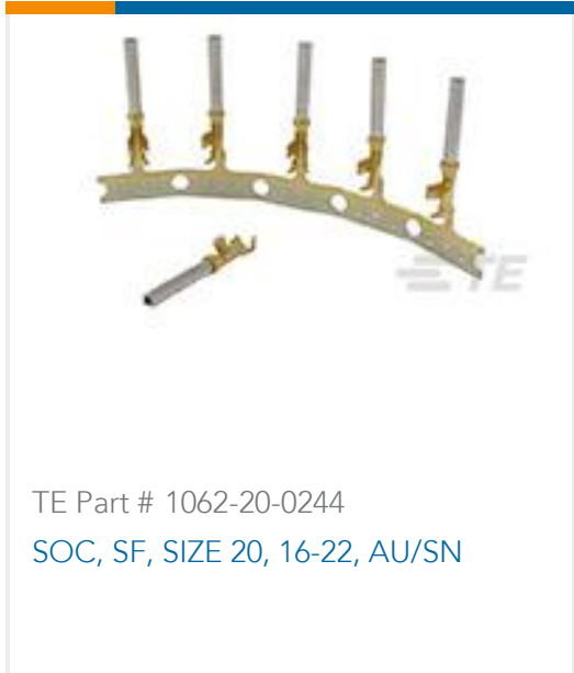
TE Part # 1062-20-0244 SOC, SF, SIZE 20, 16-22, AU/SN