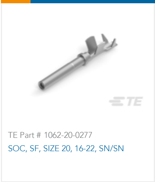
TE Part # 1062-20-0277 SOC, SF, SIZE 20, 16-22, SN/SN