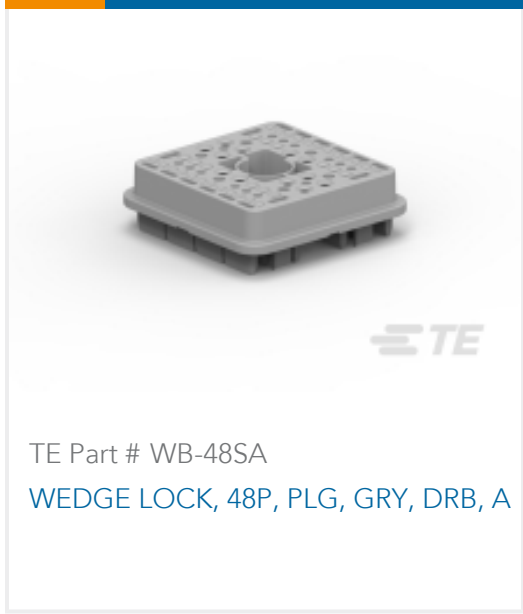
TE Part # WB-48SA WEDGE LOCK, 48P, PLG, GRY, DRB, A