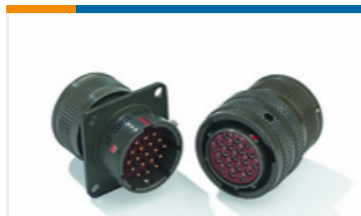
TE Part #ZPF000000000006936 951-07 R 22-55 S 50