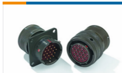
TE Part #ZPF0000000000032216 951-07 R 22-55 SX 50