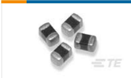
TE Part #4-1624116-4 BMB-B 0603 300R N7