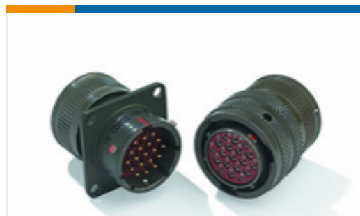
TE Part #ZPF000000000006128 951-00 R 22-55 SY 50