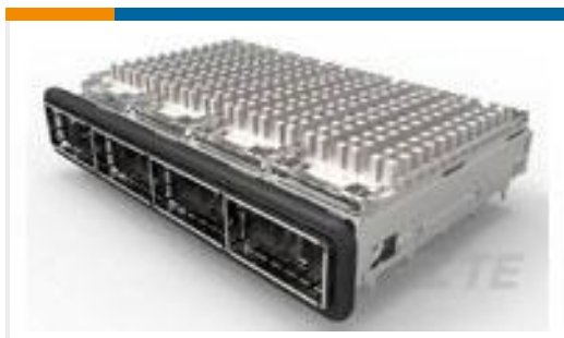
TE Part #2170287-2 1X4 CAGE ASSEMBLY, THRU BEZEL, QSFP