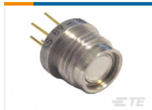
TE Part #89-05KA-0U 9MM MV OUTPUT PRESSURE SENSOR