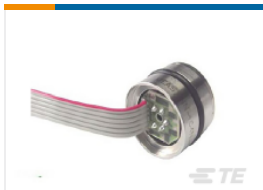
TE Part #154N-300G-R 19MM MV OUTPUT PRESSURE SENSOR