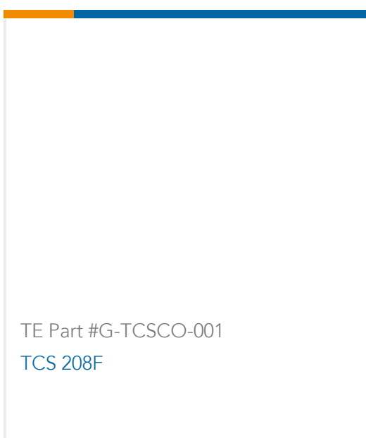
TE Part #G-TCSCO-001 TCS 208F