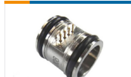
TE Part #DP86-001D Differential MV Output Pressure Sensor