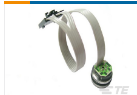
TE Part #86-100A-C 100 PSIA CABLE CONN MV PRESSURE SENSOR