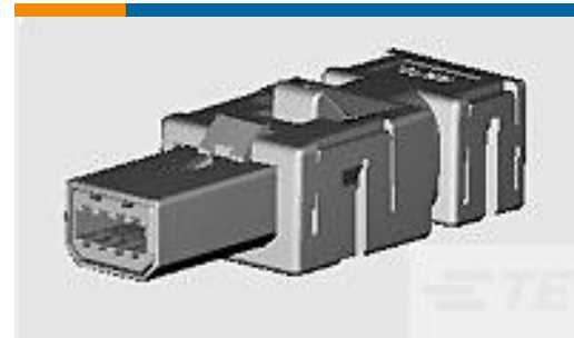
TE Part #2040008-1 INDUSTRIAL MINI I/O PLUG KIT D2