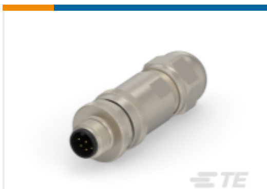
TE Part #T4111012081-000 M12 M, 8P GOLD A_CODE S SHIELDED PG9