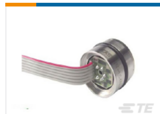
TE Part #154N-005G-RT 5 PSIG RIBBON CABLE TUBE MV PRESSURE