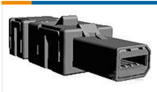
TE Part #2013595-3 INDUSTRIAL MINI I/O PLUG KIT D1 GRAY