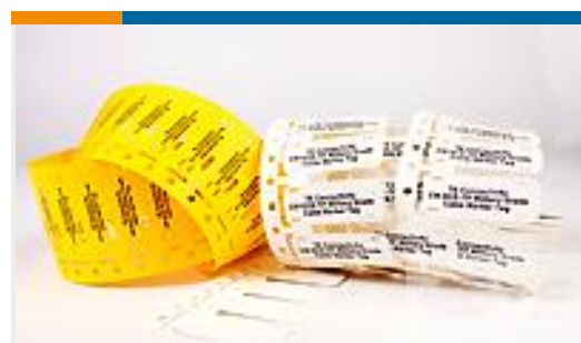
TE Part #768838-000 CM-SCE-TP-1/4-4H-9