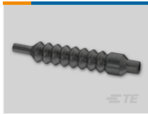
TE Part #806251-000 Convulsed Heat Shrink Uni Boots: Lipped, Straight