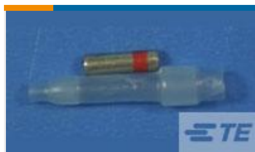
TE Part #650074N006 D-436-36CS454