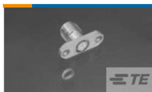
TE Part #1052634-1 2052 3356 02