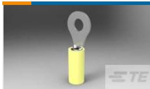
TE Part #35149 TERMINAL,PIDG R 12-10 6