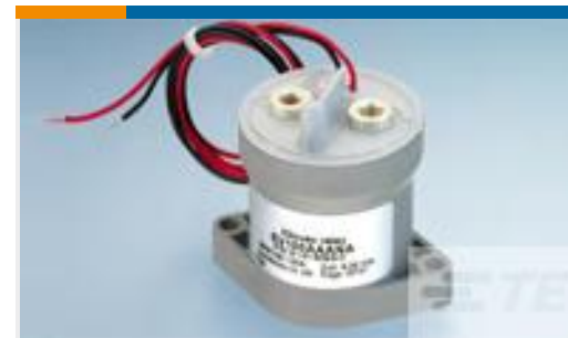
TE Part #5-1618398-0 EV100AAANA=CONTACTOR, SPST- NO 9-36Vdc