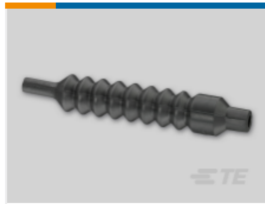
TE Part #806252-000 Convolute Heat Shrink Uni Boots: Lipped, Straight