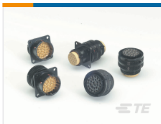
TE Part #ZPF00000000096107 FDBA 50-8-3A-PN-K-A246