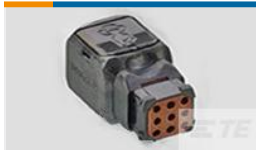
TE Part #D369-P99-NS1 369 9 WAY PLUG, CRIMP, SKT