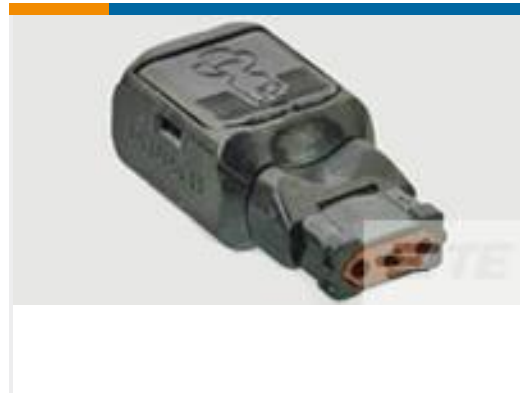
TE Part #D369-P33-NP1 369 3 WAY PLUG, CRIMP, PIN