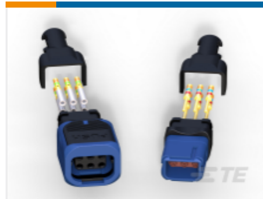
TE Part #YD369-P66-BS000000 369 6 WAY PLUG, NO CONTACTS, SKT