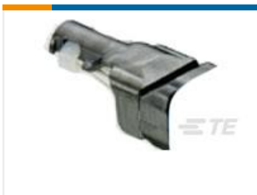
TE Part #D369-STB-6 369 6 WAY BACKSHELL STRAIGHT TIE WRAP