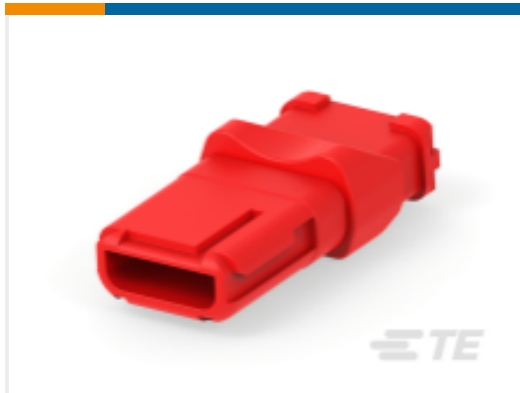
TE Part #D369-R33-NP1 Rectangular Connectors, 3 Way Receptacle