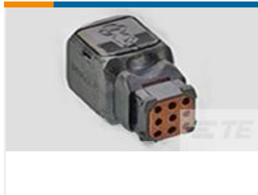
TE Part #D369-R99-NP1 369 9 WAY REC, CRIMP, PIN