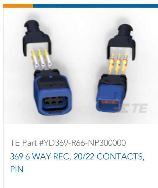
TE Part #YD369-R66-NP300000 369 6 WAY REC, 20/22 CONTACTS, PIN