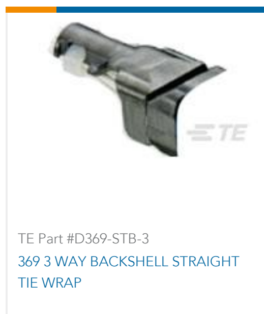
TE Part #D369-STB-3 369 3 WAY BACKSHELL STRAIGHT TIE WRAP