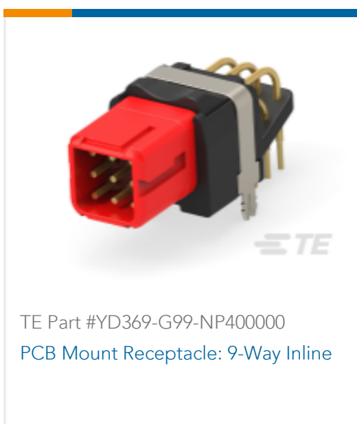
TE Part #YD369-G99-NP400000 PCB Mount Receptacle: 9-Way Inline