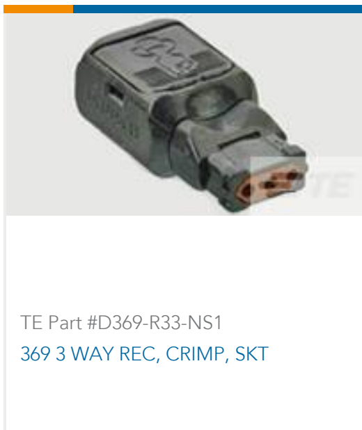
TE Part #D369-R33-NS1 369 3 WAY REC, CRIMP, SKT