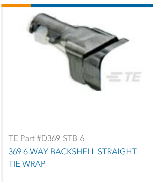
TE Part #D369-STB-6 369 6 WAY BACKSHELL STRAIGHT TIE WRAP