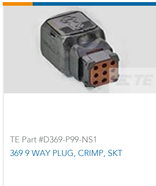
TE Part #D369-P99-NS1 369 9 WAY PLUG, CRIMP, SKT