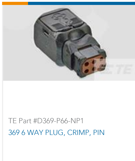
TE Part #D369-P66-NP1 369 6 WAY PLUG, CRIMP, PIN