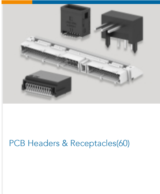
PCB Headers & Receptacles(60)