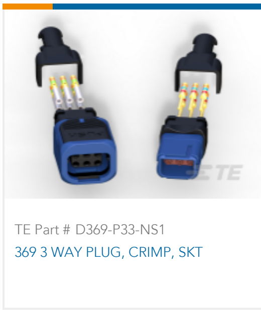
TE Part # D369-P33-NS1 369 3 WAY PLUG, CRIMP, SKT