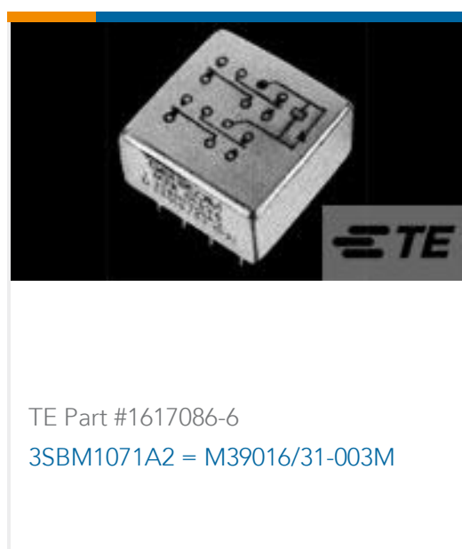
TE Part #1617086-6 3SBM1071A2 = M39016/31-003M