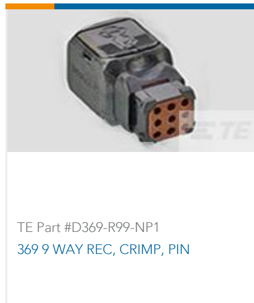
TE Part #D369-R99-NP1 369 9 WAY REC, CRIMP, PIN