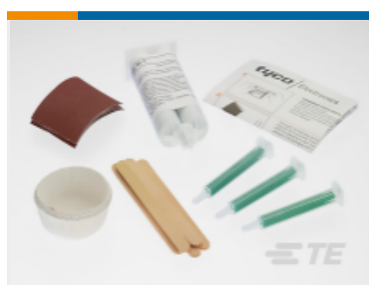
TE Part # 657863-000 S1125-KIT-8