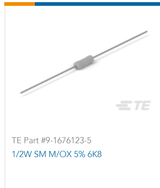
TE Part #9-1676123-5 1/2W SM M/OX 5% 6K8