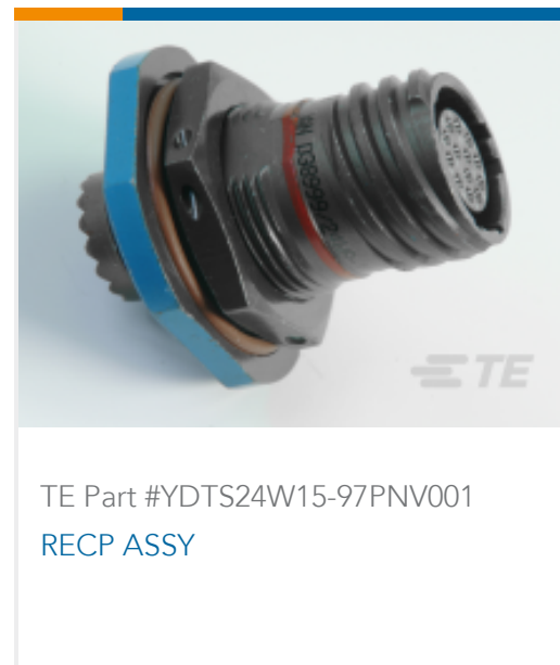
TE Part #YDTS24W15-97PNV001 RECP ASSY