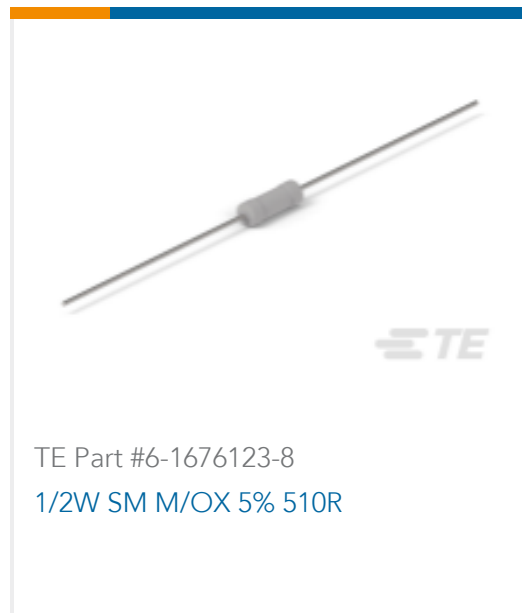
TE Part #6-1676123-8 1/2W SM M/OX 5% 510R