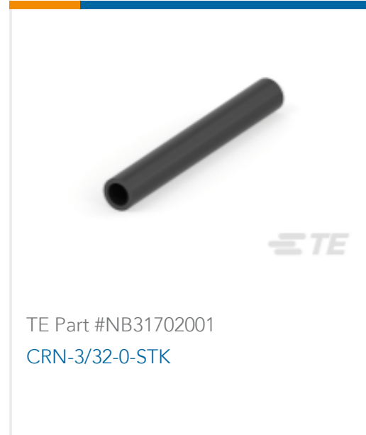
TE Part #NB31702001 CRN-3/32-0-STK