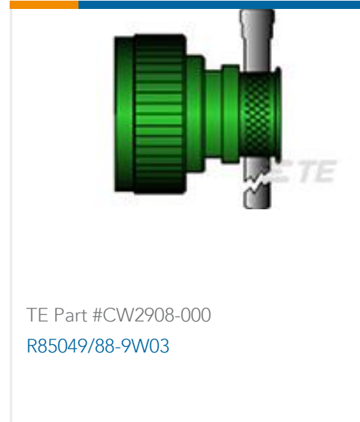
TE Part #CW2908-000 R85049/88-9W03