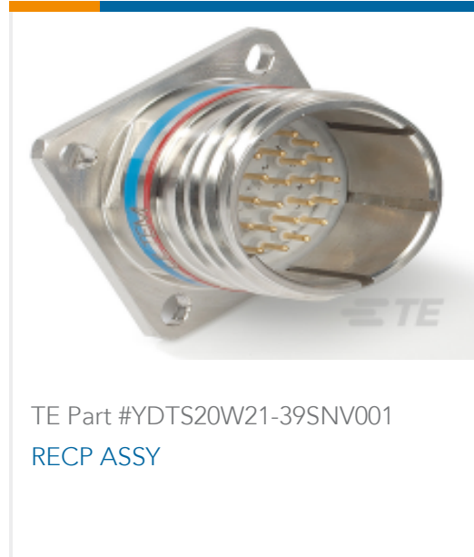
TE Part #YDTS20W21-39SNV001 RECP ASSY