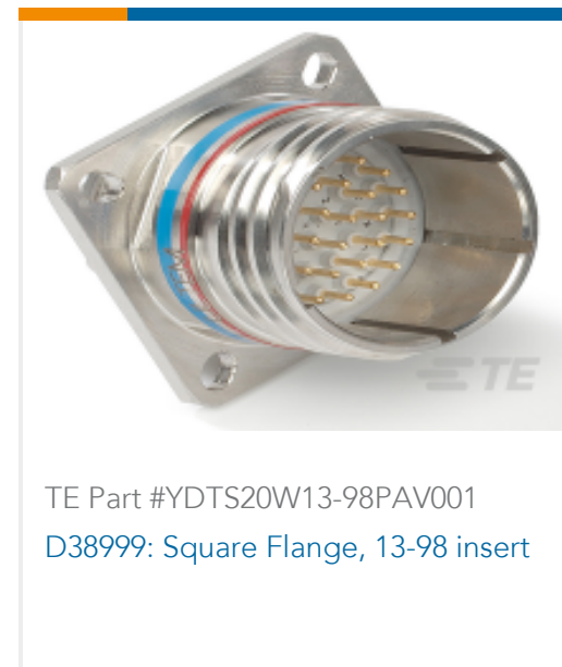
TE Part #YDTS20W13-98PAV001 D38999: Square Flange, 13-98 insert