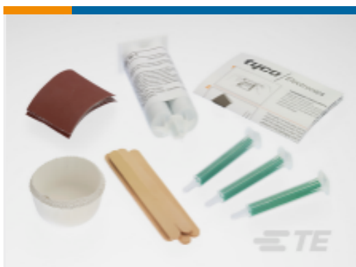
TE Part # 657863-000 S1125-KIT-8