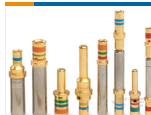
TE Part #2560-218-2031 CONT PIN