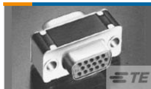
TE Part #212560-2 CONN SAVER, 15 POSN, AMPLIMITE