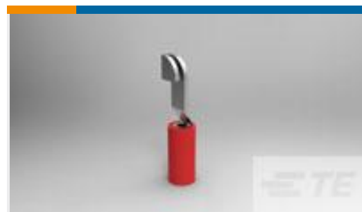
TE Part #320555 KNIFE DISCONNECT, N PIDG 22-16