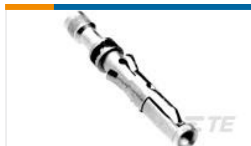
TE Part #201328-1 CONTACT SOCKET ASSY.