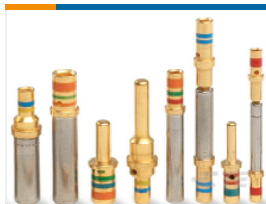
TE Part #1662-213-2031 CONT SOC ASSY