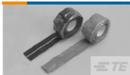
TE Part #608036-1 SILICONE FUSION TAPE,1"X36'