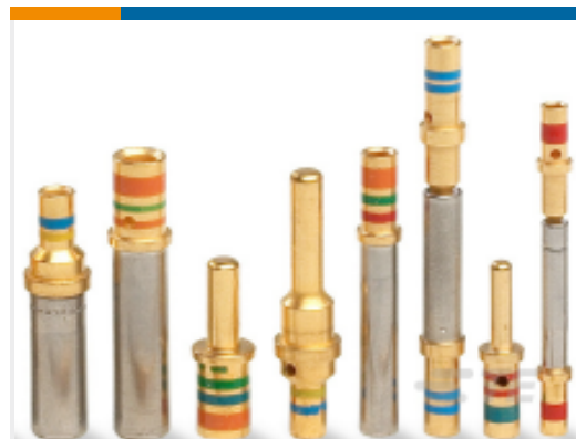
TE Part #0641-1-2031L CONT PIN