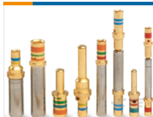
TE Part #2841-5-9000 CONT PIN