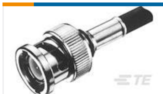
TE Part #5225395-6 BNC PLUG DUAL CP RG142