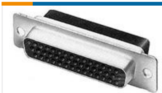
TE Part #1658682-1 HDP-22,RCPT,SIZE 2,26 POSN