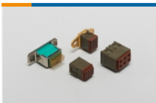
Terminal Junction Modules(120)