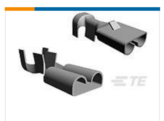
TE Part #160927-4 FF 250 REC 1.0-2.5MM2 TPPB