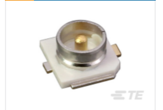
TE Part # CONMHF1-SMD-T U.FL/MHF1 Jack 50 Ohm PCB Surface Mount