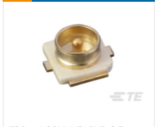
TE Part # CONMHF1-SMD-G-T U.FL/MHF1 Jack 50 Ohm PCB Surface Mount