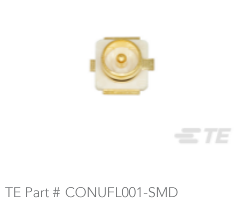
TE Part # CONUFL001-SMD Conn UFL MHF Straight PCB Mount Jack