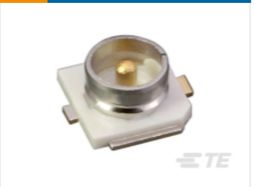
TE Part # CONMHF1-SMD-T U.FL/MHF1 Jack 50 Ohm PCB Surface Mount