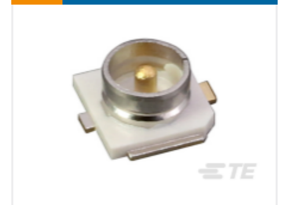
TE Part # CONMHF1-SMD-T U.FL/MHF1 Jack 50 Ohm PCB Surface Mount