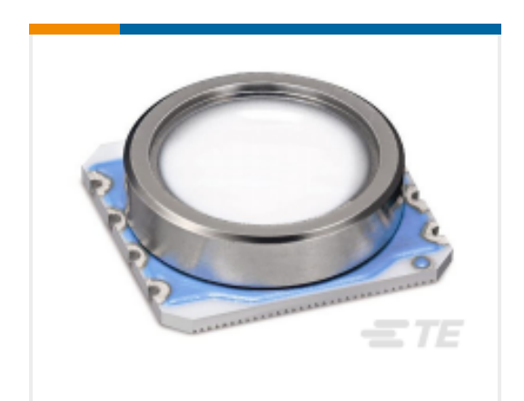
TE Part #MS580314BA01-00 MS5803-14BA01 DIGIT PRESSURE SENSOR TUBE