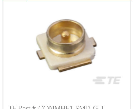
TE Part # CONMHF1-SMD-G-T U.FL/MHF1 Jack 50 Ohm PCB Surface Mount