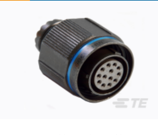
TE Part #YDTS26F17-35PNV001