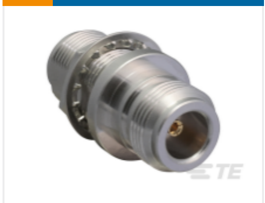
TE Part #ADP-NF-NF-B-W N Type Jack to N Type Jack Bulkhead