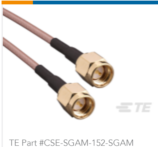
SMA to SMA 152mm RG316