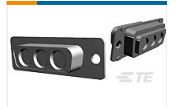
TE Part #445705-7 AMPLIMITE COAX MIX,3C3