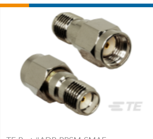
TE Part #ADP-RPSM-SMAF RP-SMA Plug to SMA Jack