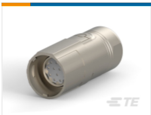
TE Part #ASA013N00620100000 623 PLUG, SPEEDTEC