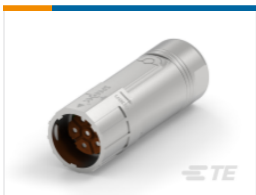
TE Part #BSA085N00420100000 923 PLUG, SPEEDTEC