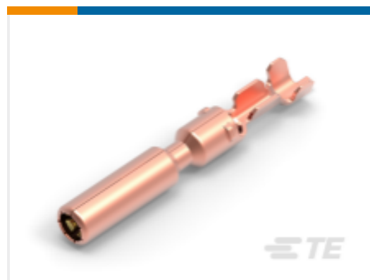
TE Part #60-0199-080-000 BANDOLEER CONTACT SOCKET 1MM, 7000PCS ROL