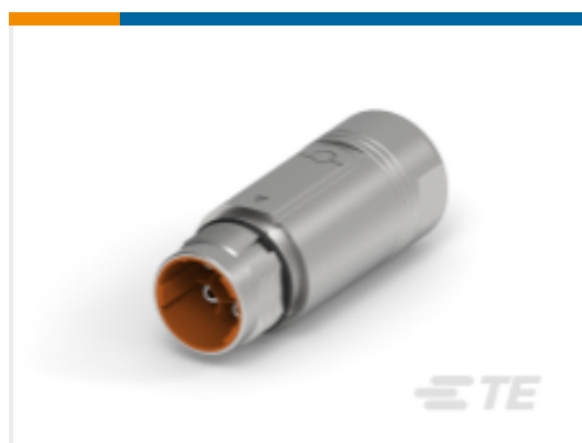
TE Part #BKA186N00420200000 923 EXTENSION, SPEEDTEC-READY