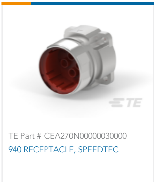
TE Part # CEA270N00000030000 940 RECEPTACLE, SPEEDTEC