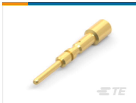
TE Part #61-0021-011-000 CONTACT PIN 2 MM