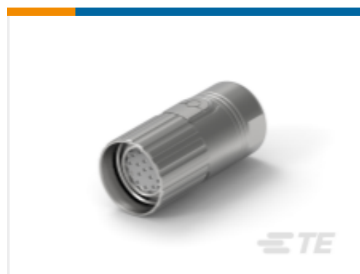
TE Part #ASA035N00620235000 623 PLUG