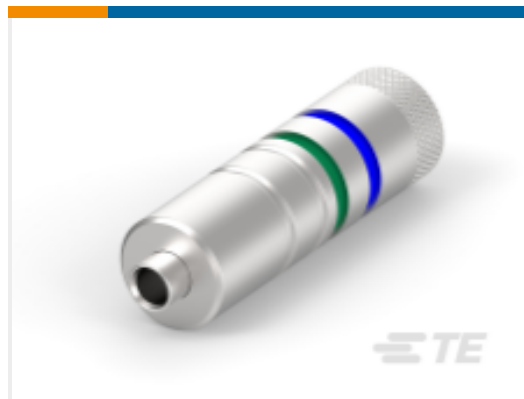
TE Part # C0-0004-000-000 POSITIONING INSERT FOR 2 MM CONTACTS