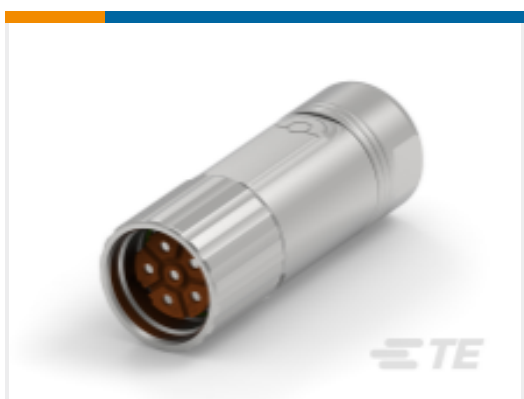
TE Part #BSA085N00420235000 923 PLUG