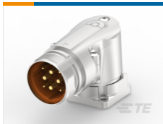
TE Part # CGE270N00000020000 940 RECEPTACLE ANGLED, ROTATABLE, SPEEDTEC