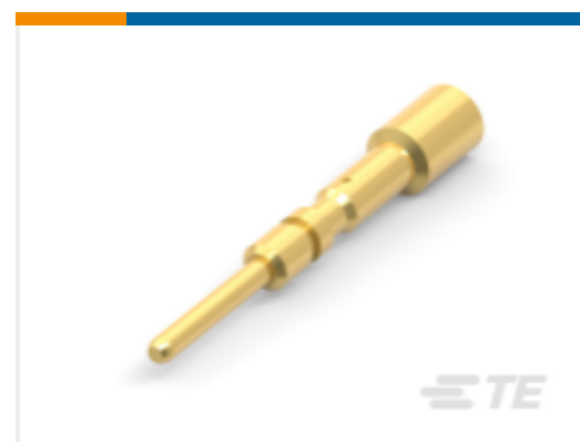
TE Part #61-0021-011-000 CONTACT PIN 2 MM