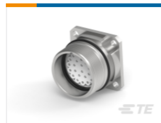
TE Part #AEA385N0000002K000 627 RECEPTACLE, 26-PIN