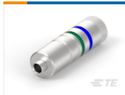
TE Part # C0-0004-000-000 POSITIONING INSERT FOR 2 MM CONTACTS