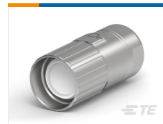
TE Part #ASA000N00410235000 623 PLUG