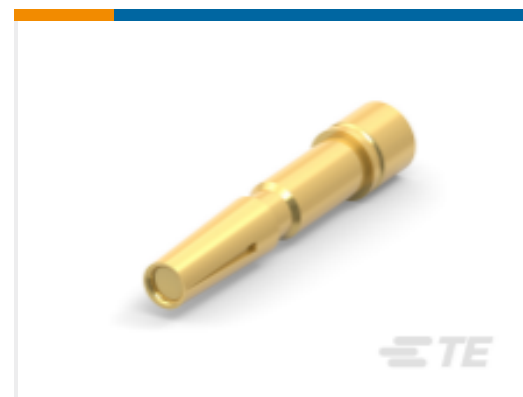
TE Part #60-0070-011-000 CONTACT SOCKET 1,5 MM