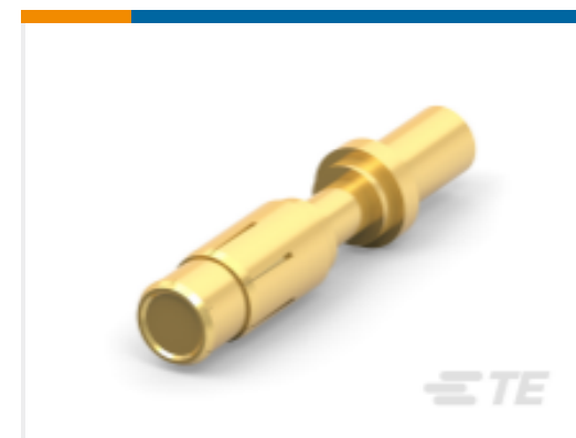
TE Part #60-0225-011-000 CONTACT SOCKET 3,6 MM