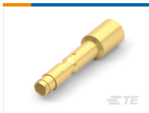
TE Part #60-0254-011-000 CONTACT SOCKET 2 MM