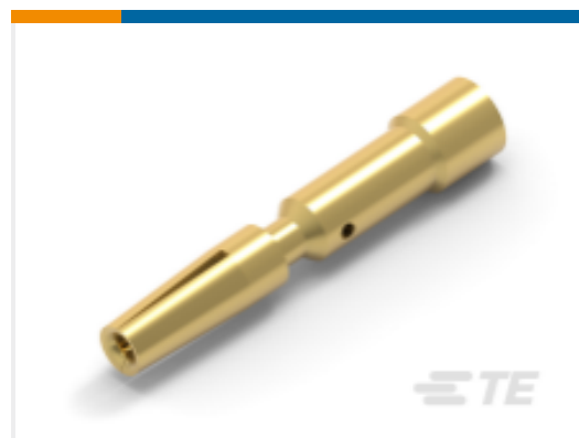
TE Part #60-0011-011-000 CONTACT SOCKET 1 MM