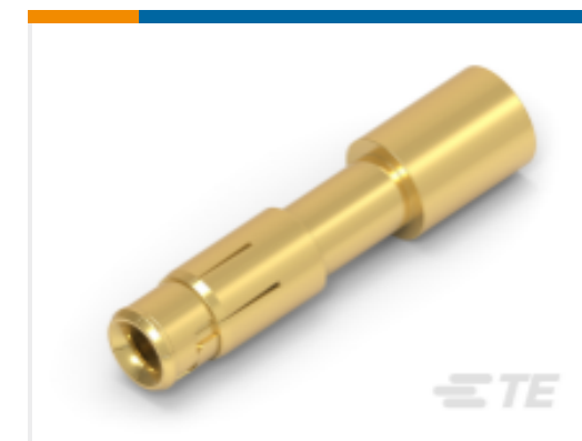
TE Part #60-0227-011-000 CONTACT SOCKET 3,6 MM