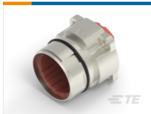
TE Part # CEA270N00000051000 940 RECEPTACLE, SPEEDTEC-READY