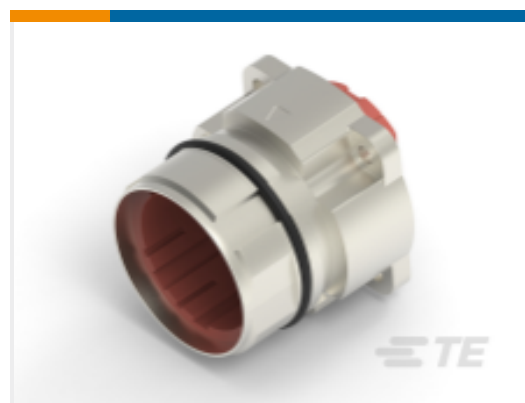
TE Part # CEA270N00000051000 940 RECEPTACLE, SPEEDTEC-READY