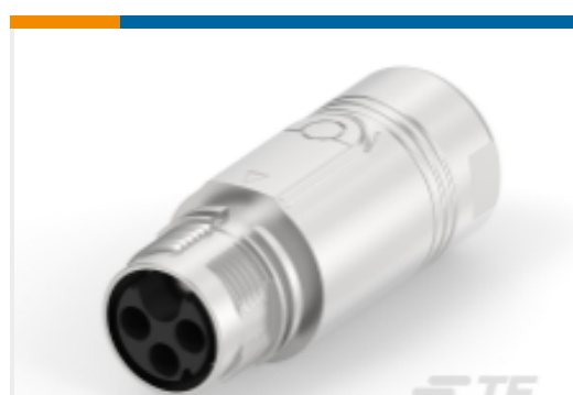
TE Part #BKA894N0086056A000 917 EXTENSION, SPEEDTEC