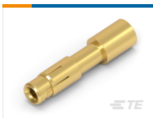
TE Part #60-0227-011-000 CONTACT SOCKET 3,6 MM