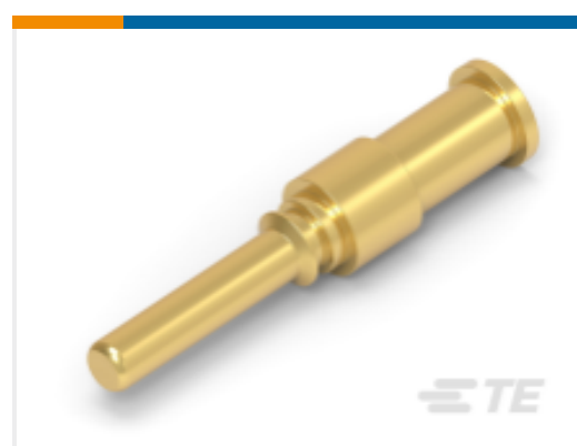
TE Part #61-0195-011-000 CONTACT PIN 3.6 MM