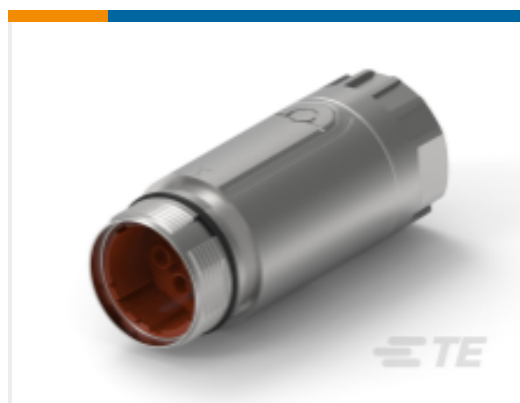
TE Part # CKA267N00250051000 940 EXTENSION, SPEEDTEC-READY