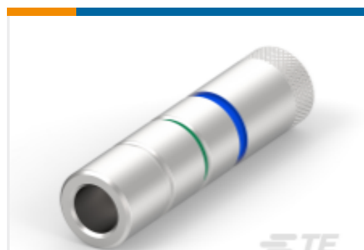
TE Part # C0-0010-000-000 POSITIONING INSERT FOR 3.6 MM CONTACTS