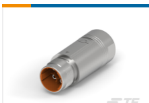
TE Part #BKA186N00580100000 923 EXTENSION, SPEEDTEC