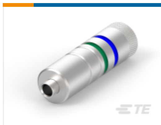
TE Part # C0-0004-000-000 POSITIONING INSERT FOR 2 MM CONTACTS