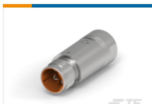
TE Part #BKA186N00550100000 923 EXTENSION, SPEEDTEC