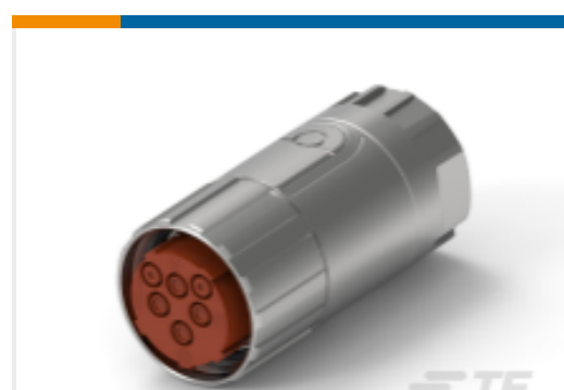
TE Part #CSA263N00260001000 940 PLUG