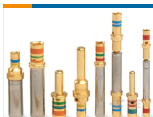
TE Part #41160-203-1631L CONT PIN