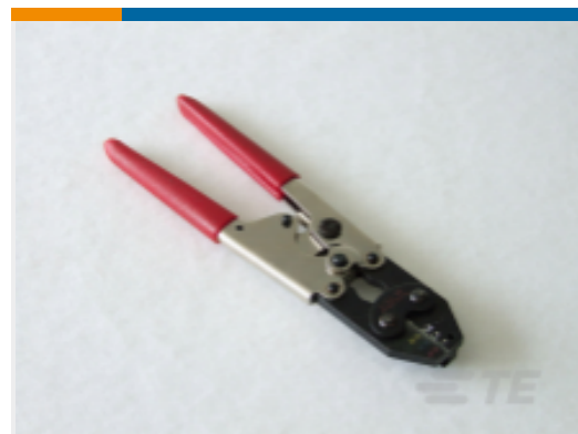
TE Part # 992008-000 AD-1377-CRIMP-TOOL-3-CVTY