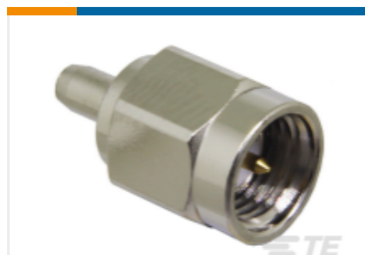
TE Part #CON SMA007-R178 SMA Plug 50 Ohm Cable Crimp