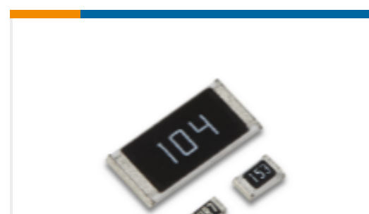
TE Part #1-2176345-5 CRGCQ 1210 150R 1%