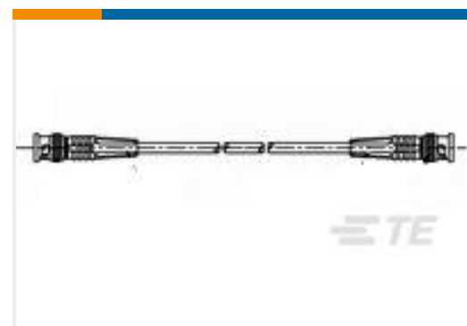
TE Part #1337769-3 50 OHM COAX BNC STR PLUG STR P