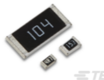
TE Part #3-2176337-9 CRGCQ 0402 15K 1%