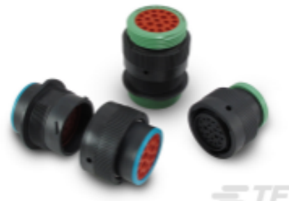
TE Part #HDP24-24-47SE-L017 DEUTSCH HDP20 Housings