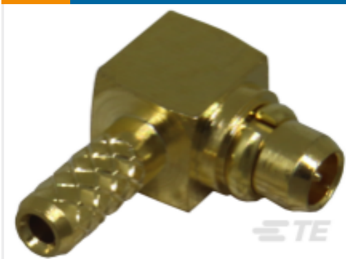
TE Part # CONMMCX012-R178 MMCX Jack 50 Ohm Cable Crimp