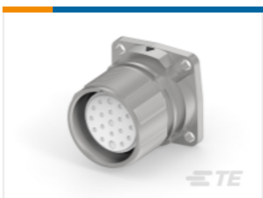
TE Part #AEA378N000000101000 623 RECEPTACLE, SPEEDTEC