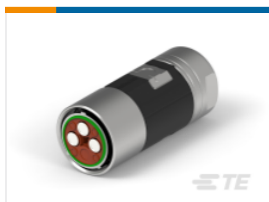
TE Part #DSA001N00740001000 958 PLUG