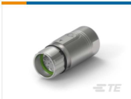
TE Part #AKA015N00400200000 623 EXTENSION, SPEEDTEC-READY