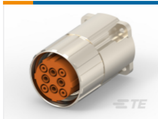
TE Part # CDA265N0000001000 940 BULKHEAD CONNECTOR