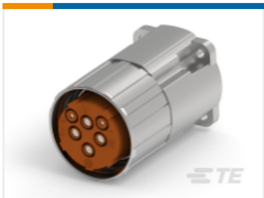
TE Part #CDA263N0000001000 940 BULKHEAD CONNECTOR