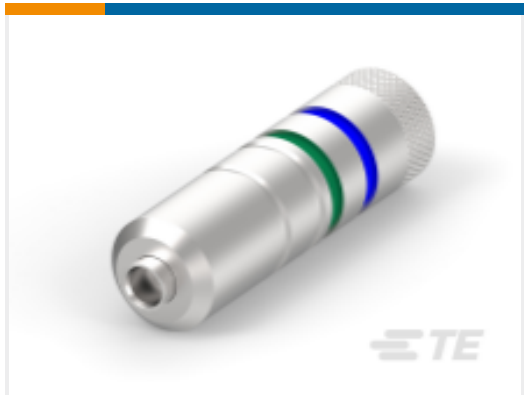
TE Part # C0-0009-000-000 POSITIONING INSERT FOR 2 MM CONTACTS