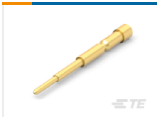
TE Part #61-0020-011-000 CONTACT PIN 1 MM