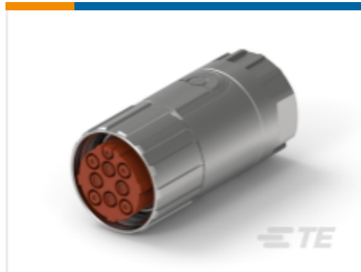
TE Part # CSA265N00450001000 940 PLUG