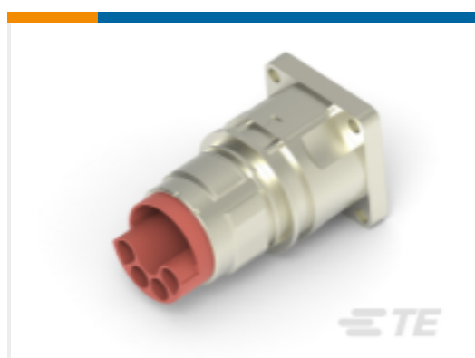
TE Part #HEC005N000000300000 723 HTEC RECEPTACLE, SPEEDTEC