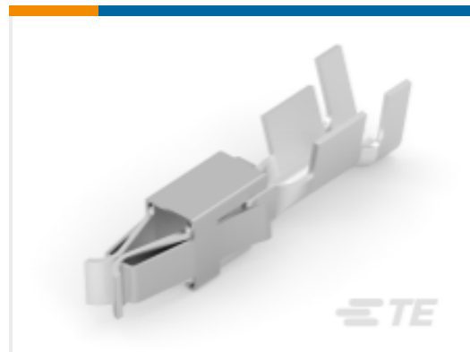
TE Part #927777-1 JUNIOR POWER TIMER CONTACT