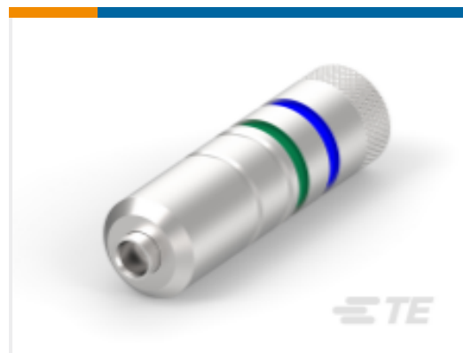
TE Part # C0-0009-000-000 POSITIONING INSERT FOR 2 MM CONTACTS