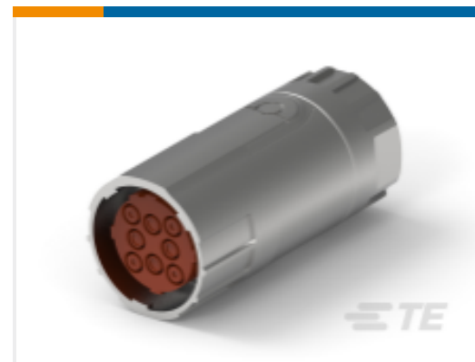
TE Part # CSA263N00440001000 940 PLUG