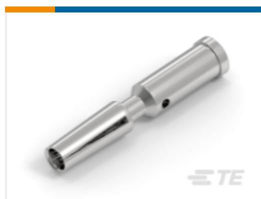
TE Part #60-0334-0B2-000 CONTACT SOCKET 1 MM