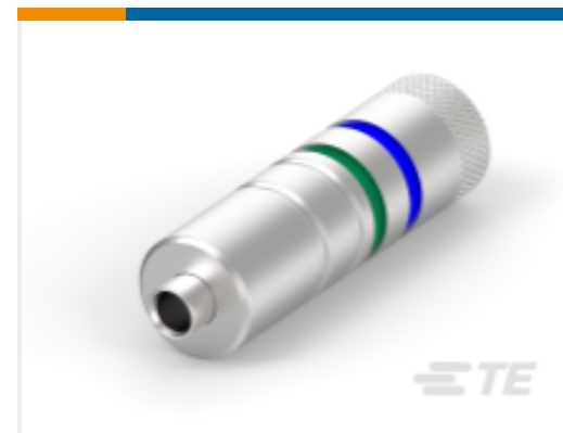
TE Part # C0-0004-000-000 POSITIONING INSERT FOR 2 MM CONTACTS