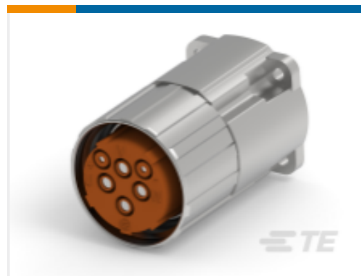
TE Part # CDA263N00000001000 940 BULKHEAD CONNECTOR