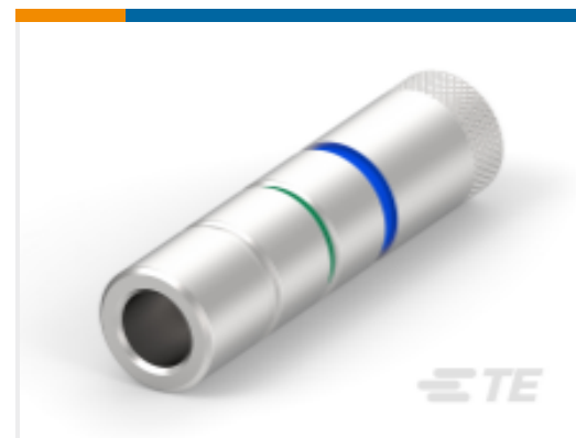
TE Part # C0-0010-000-000 POSITIONING INSERT FOR 3.6 MM CONTACTS