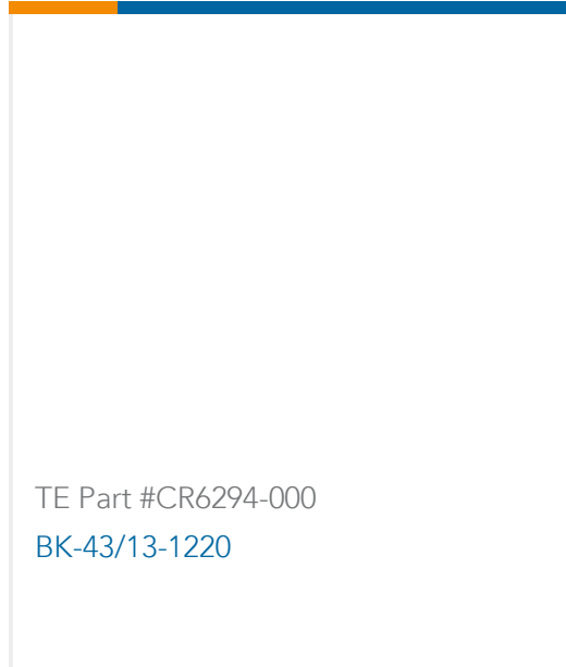
TE Part #CR6294-000 BK-43/13-1220