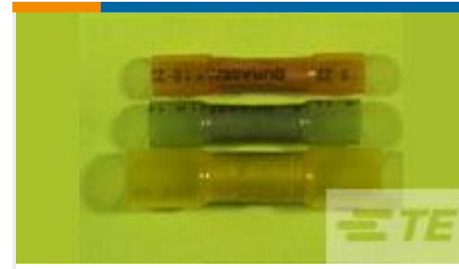
TE Part #CC2633-000 D-406-0002CS100