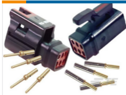
TE Part #ASC105-06SE RECEPT.AS MODULAR. SKT.