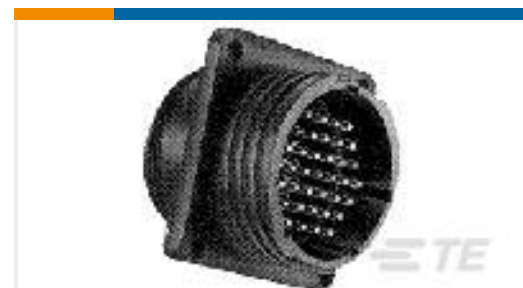
TE Part #206705-1 CPC RECP. ASY SIZE 13-9