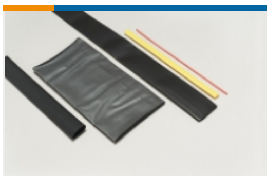
Heat Shrink Tubing(45)