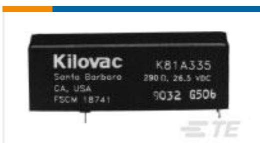
TE Part #1618241-5 K81A235=RELAY, VACUUM, SPST-NO