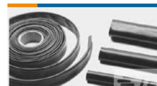
TE Part #CB5033-000 BSTS-13X25/CL