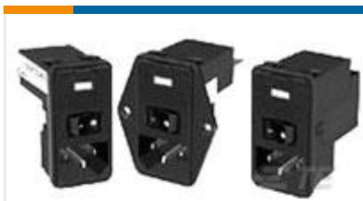
TE Part #6609107-6 PS0SXDS30=C1031