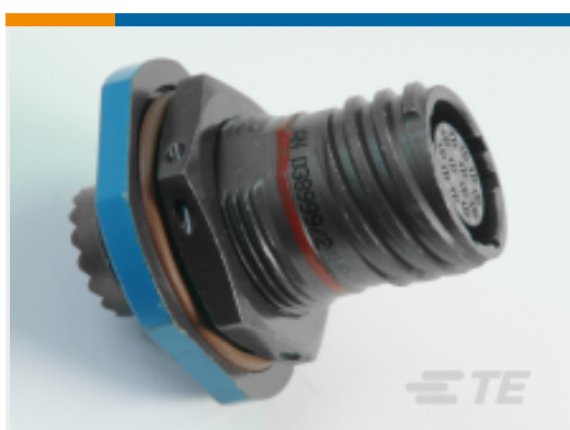
TE Part #YDTS24W11-05SAV001 RECP ASSY