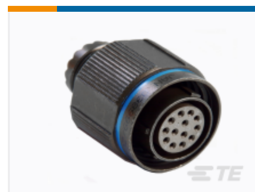
TE Part #YDTS26W17-08PAV001 PLUG ASSY