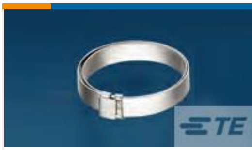
TE Part #CW2822-000 R85049/128-1