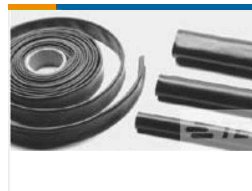
TE Part #CB5023-000 BSTS-11X25